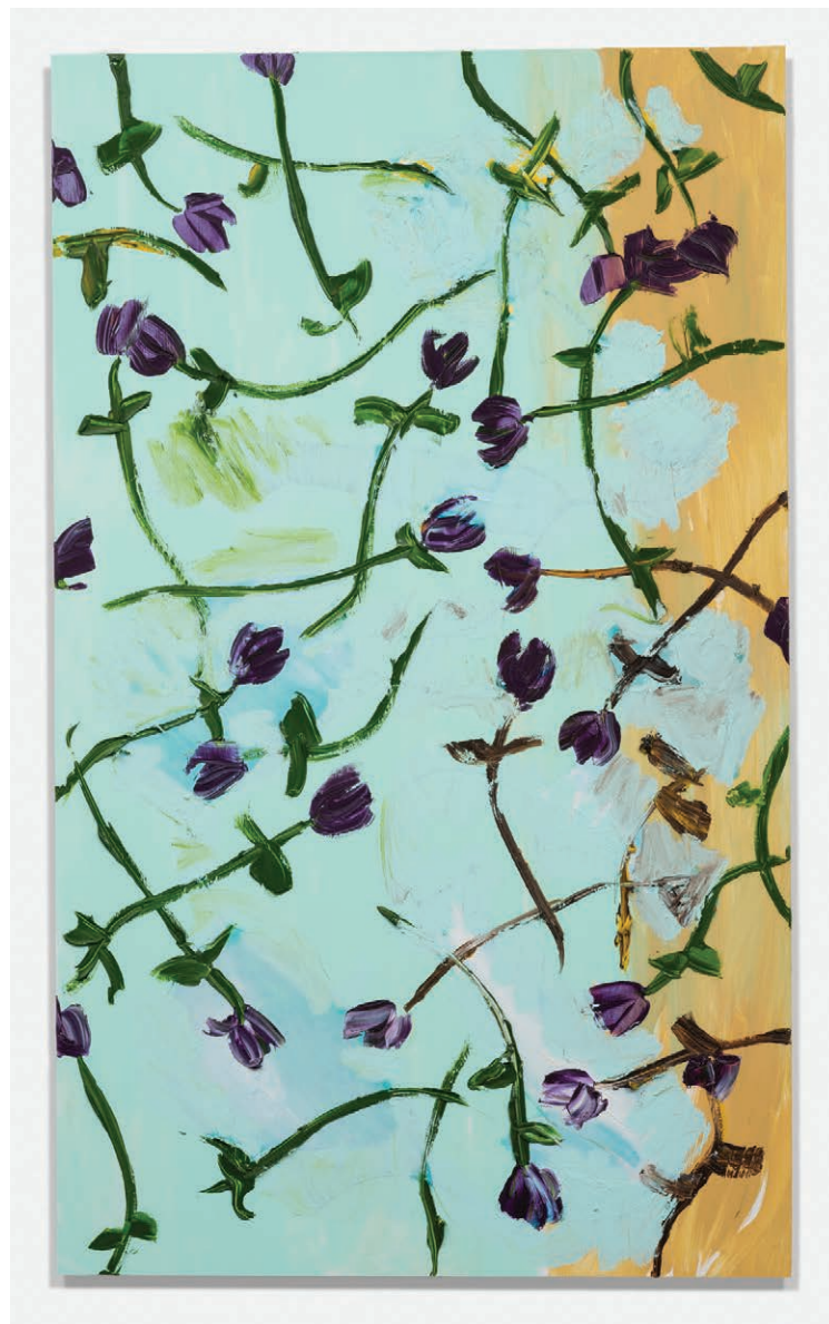
"Purple Falling Flowers" 36 x 60 inches (Orientation Variable), Oil and Acrylic on Linen, 2022