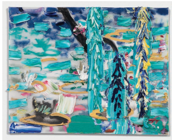
“Blue Lilies” 22 x 28 inches, Oil and Resin on Canvas, 2022