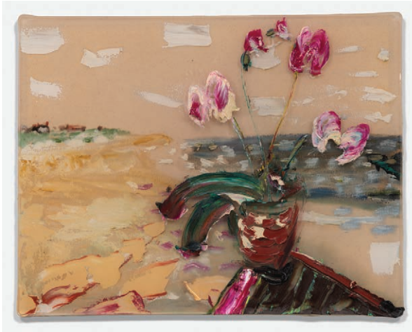
“Sag Beach Orchid” 18 x 23 inches, Oil and Resin on Canvas, 2021