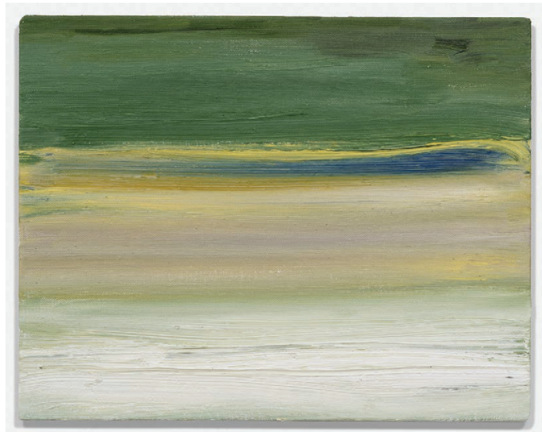
“Blue Wave” 11 x 14 inches, Oil on Linen, 2021