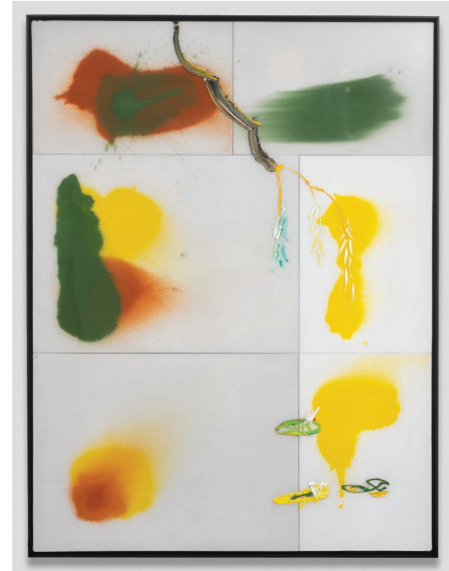
"Poured Lilies" 96 x 72 inches, Oil and Resin on Linen, 2021