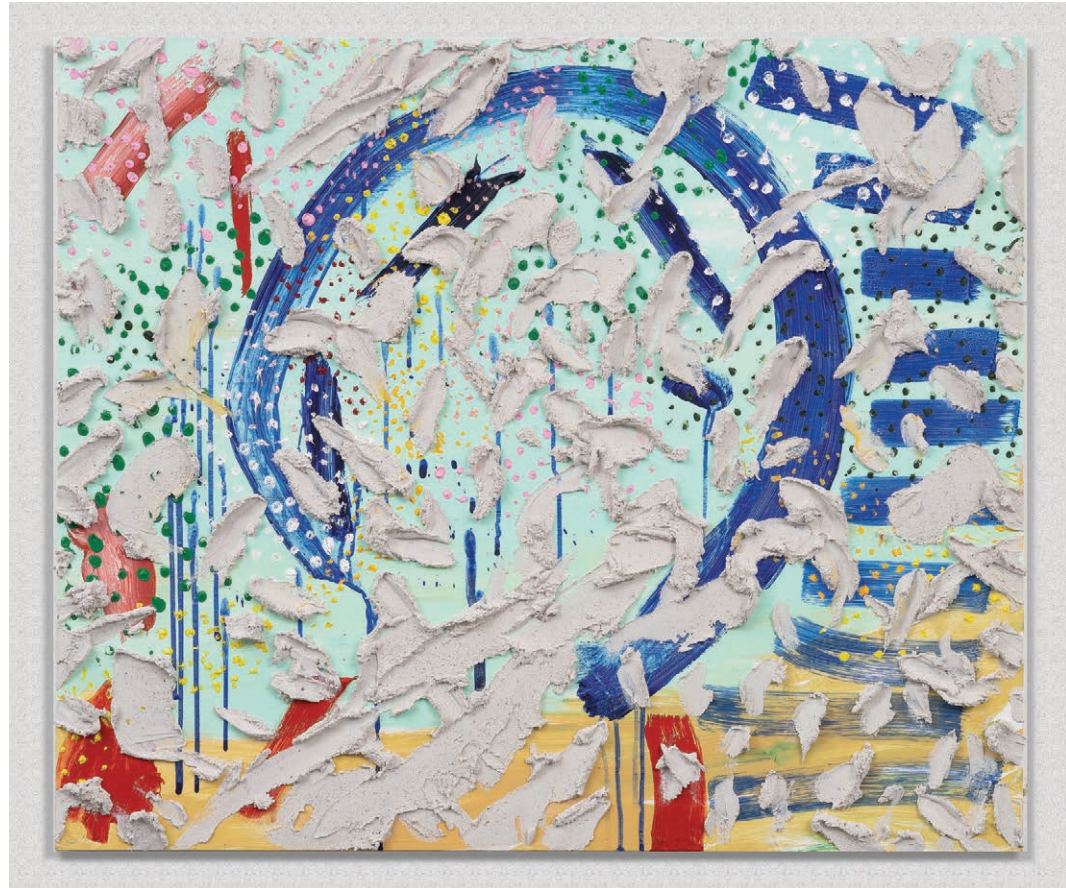
“Untitled Abstraction” 32 x 38 inches, Oil, Acrylic and Cement on Linen, 2022