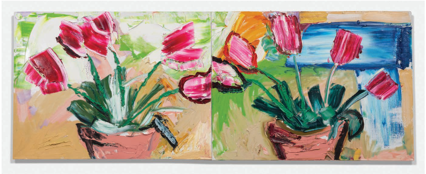
“Untitled - Two Pots” 36 x 96 inches, Oil on Linen, 2022