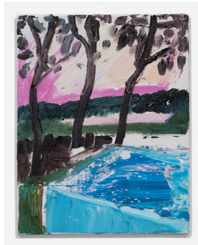
"Pool" 14 x 11 inches, Oil on Linen, 2021