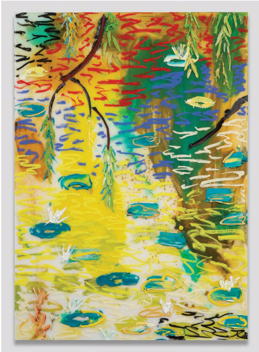
"Waterlilies on Yellow Abstract" 77 x 55 inches, Oil, Acrylic and Resin on Linen, 2021