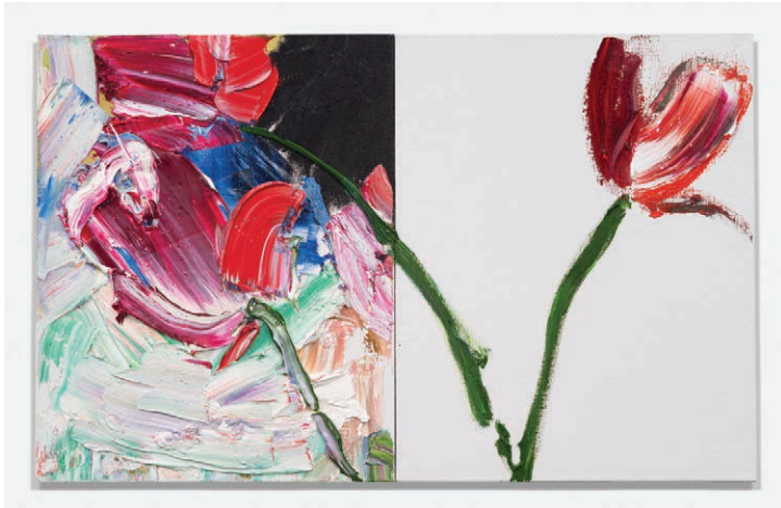
“Flower Diptych” 20 x 32 inches, Oil on Linen, 2022