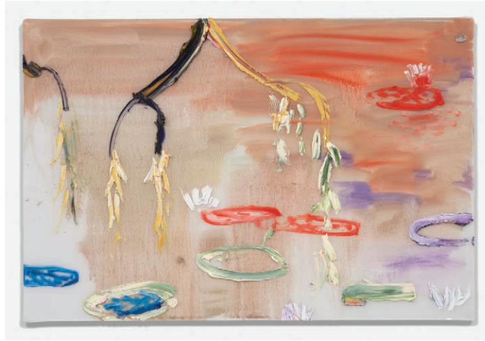
“Maple Lilies” 24 x 36 inches, Oil and Resin on Linen, 2022