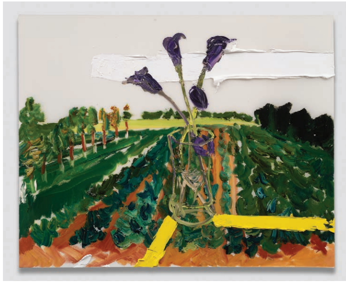
“Calla Lily on Yellow Glass Table” 32.5 x 36.5 inches, Oil and Resin on Linen, 2021