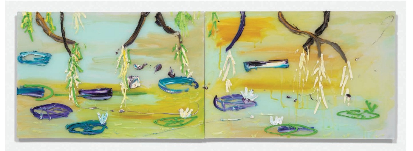
“Spring Morning Lilies” 24 x 72 inches, Oil and Resin on Linen, 2022