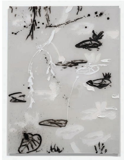
"Black and White Lily" 48 x 36 inches, Oil and Resin on Linen, 2022