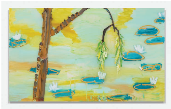
"Bright Lilies" 36 x 60 inches, Oil, Acrylic and Resin on Linen, 2021