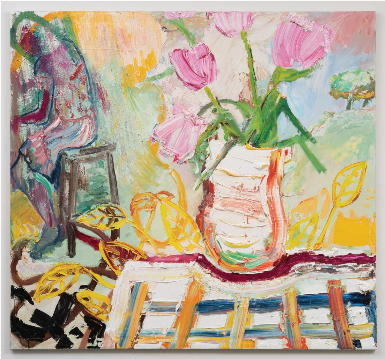
"The Patio Lesson" 72 x 78 inches, Oil on Linen, 2020