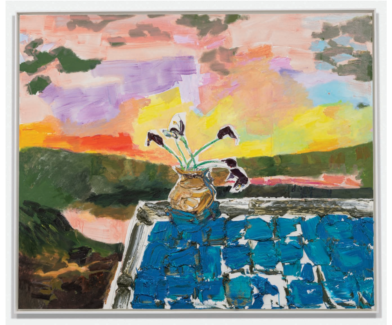
“Calla Lilies on Crooked Pond” 60 x 72 inches, Oil on Linen, 2022