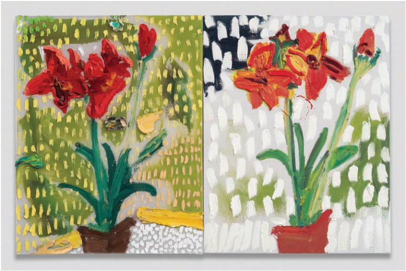
“Nasturtium Diptych” 28 x 44 inches, Oil and Acrylic on Linen, 2021