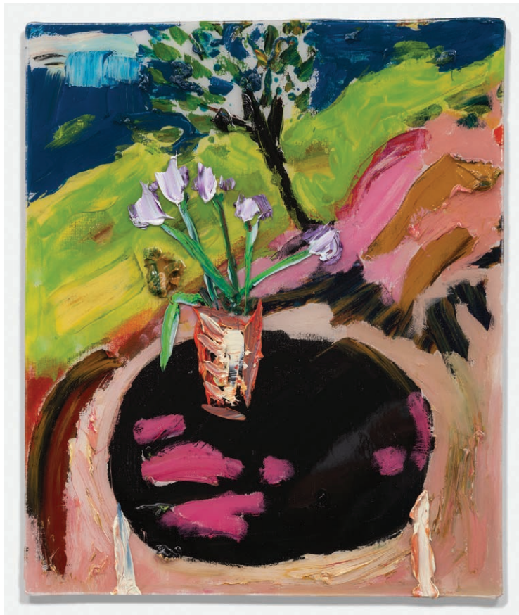
"Black Table" 24 x 20 inches, Oil and Resin on Linen, 2022