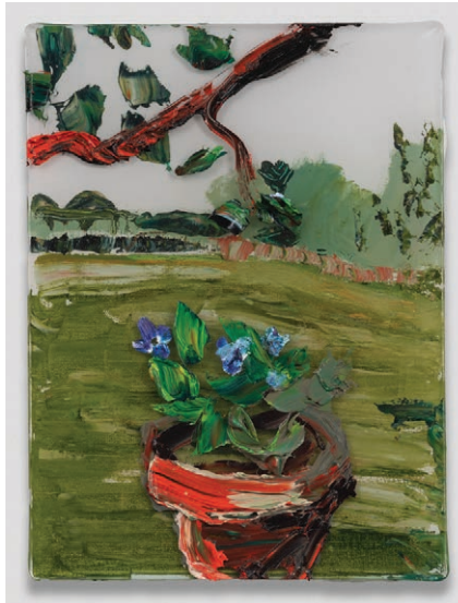
"African Violets on Sag Field" 19 x 14 inches, Oil and Resin on Linen, 2021