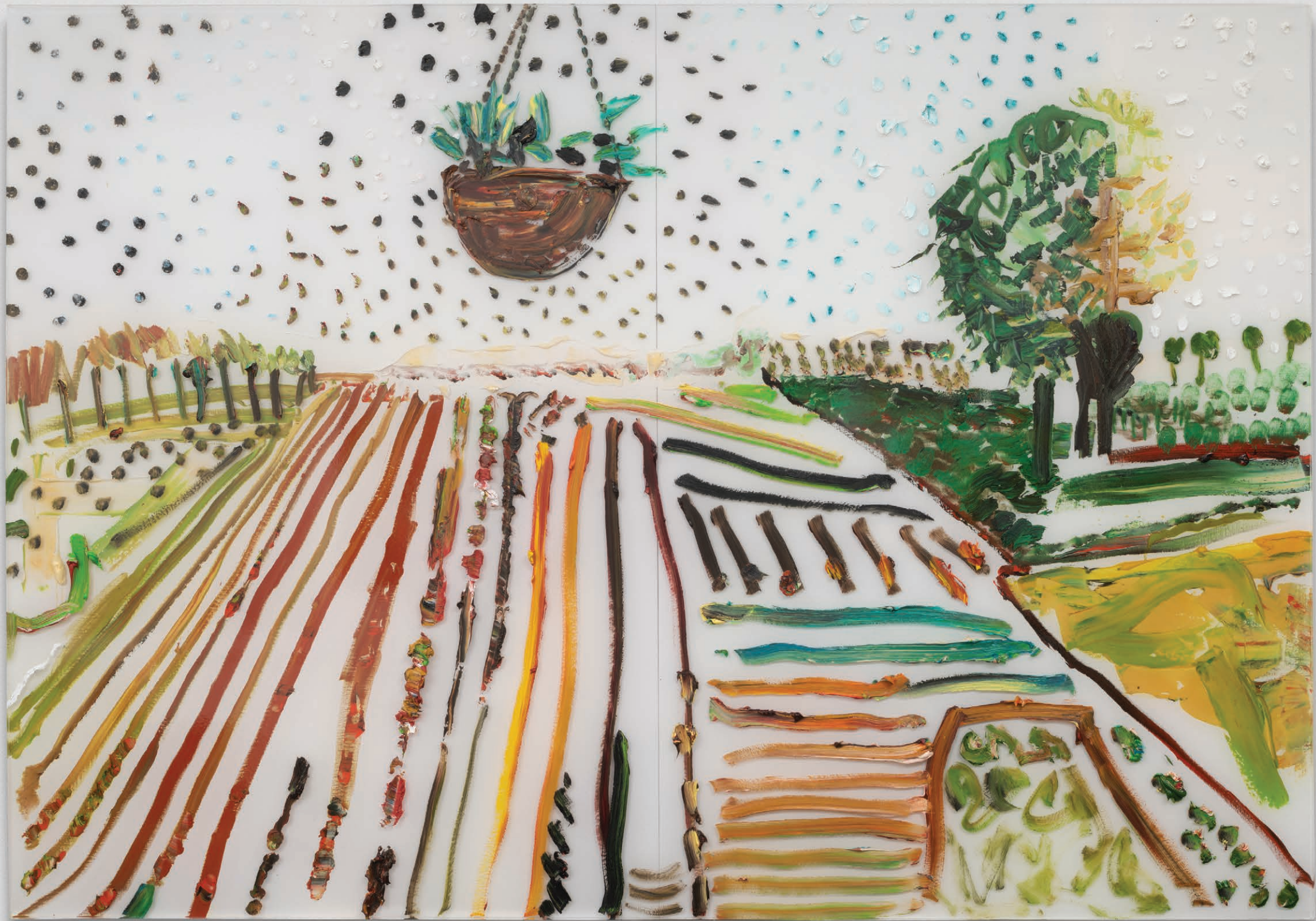
"Parsonage Field," 77 x 110 inches, Oil, Acrylic and Resin on Canvas, 2021