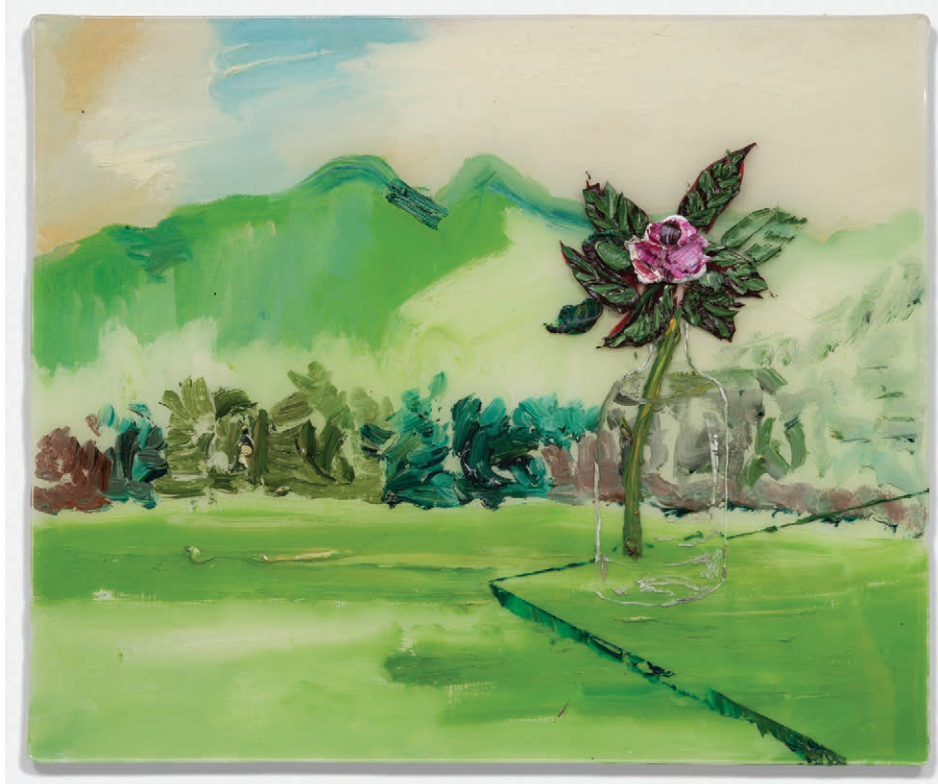
"Glass Table" 20 x 24 inches, Oil and Resin on Linen, 2022