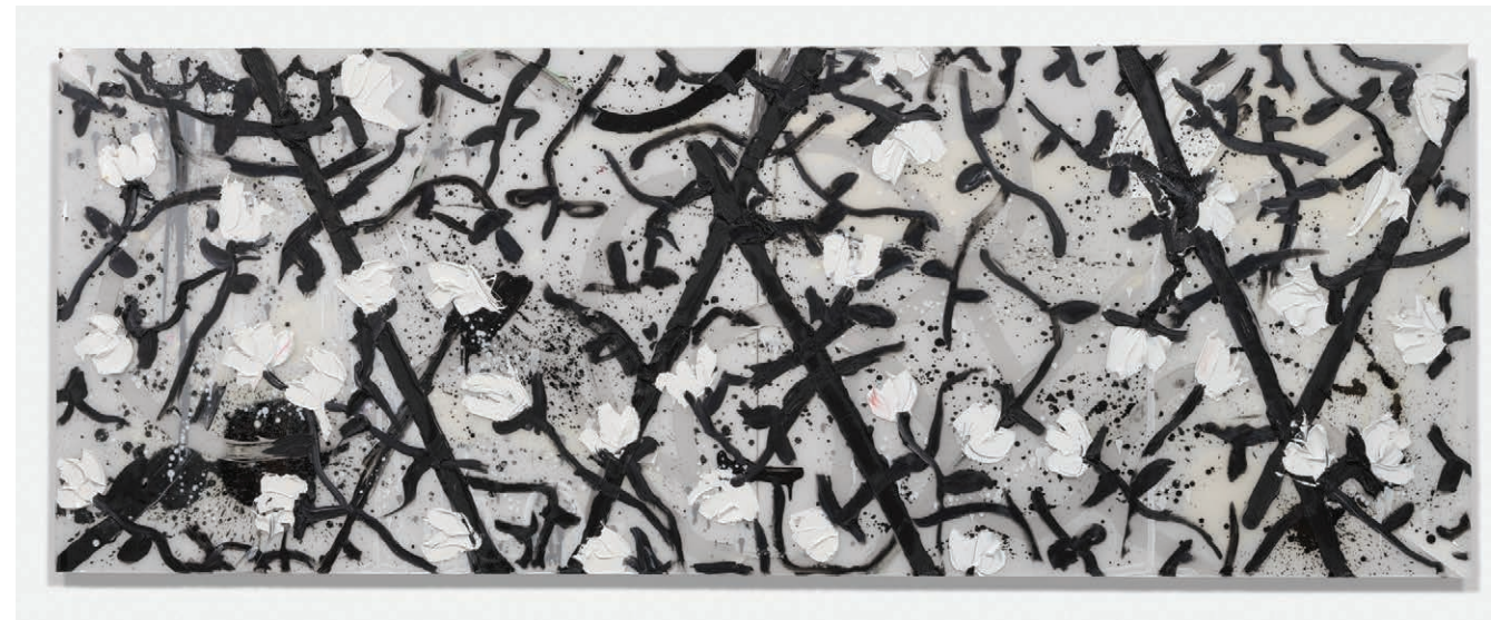
"Falling Flower Lattice" 96 x 36 inches (Orientation Variable), Oil, Acrylic and Resin on Linen, 2022