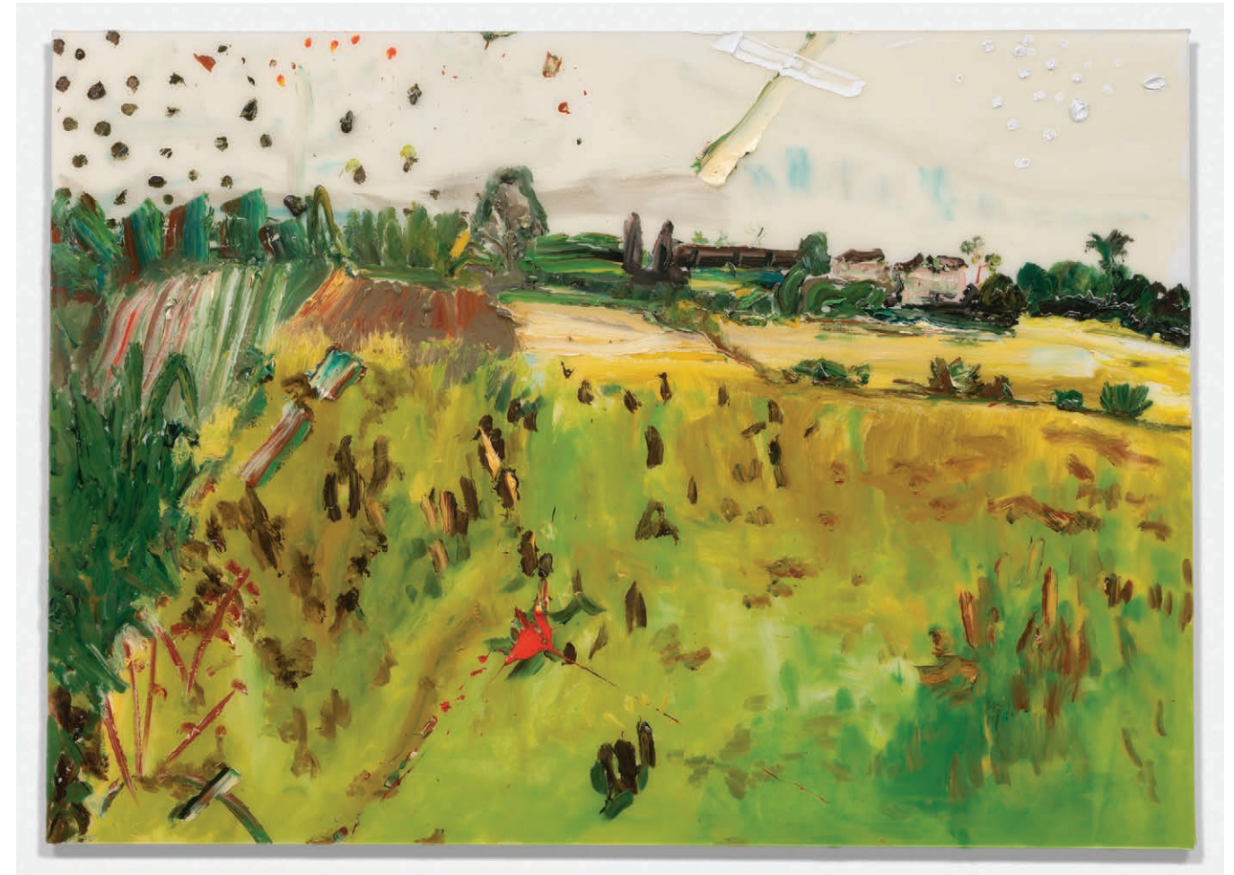
“Highland Terrace” 55 x 77 inches, Oil and Resin on Linen, 2022