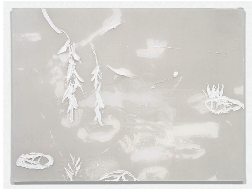
"White Lily" 36 x 48 inches, Oil, Acrylic and Resin on Linen, 2021