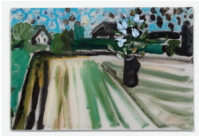
“Blue Flowers in Black Vase” 24 x 36 inches, Oil and Resin on Linen, 2022