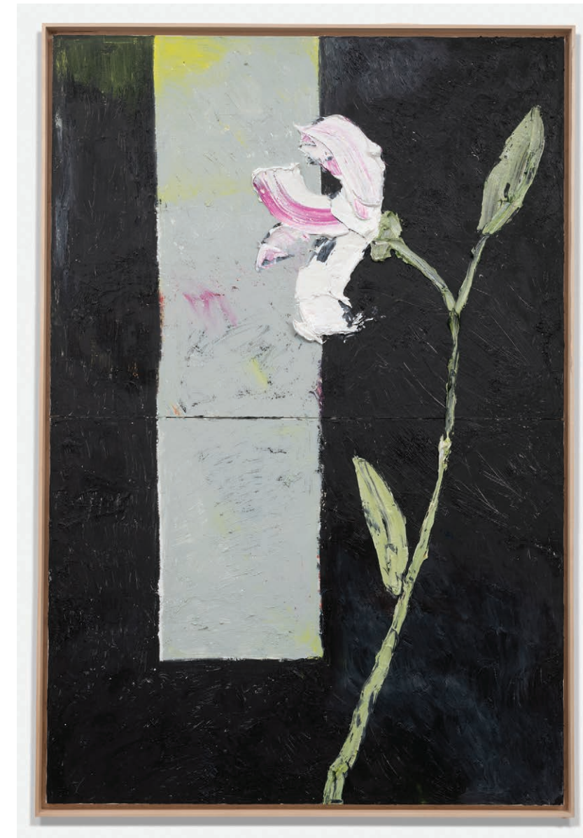
"Untitled - Lily Diptych" 76 x 51 Inches, Oil on Linen, 2022