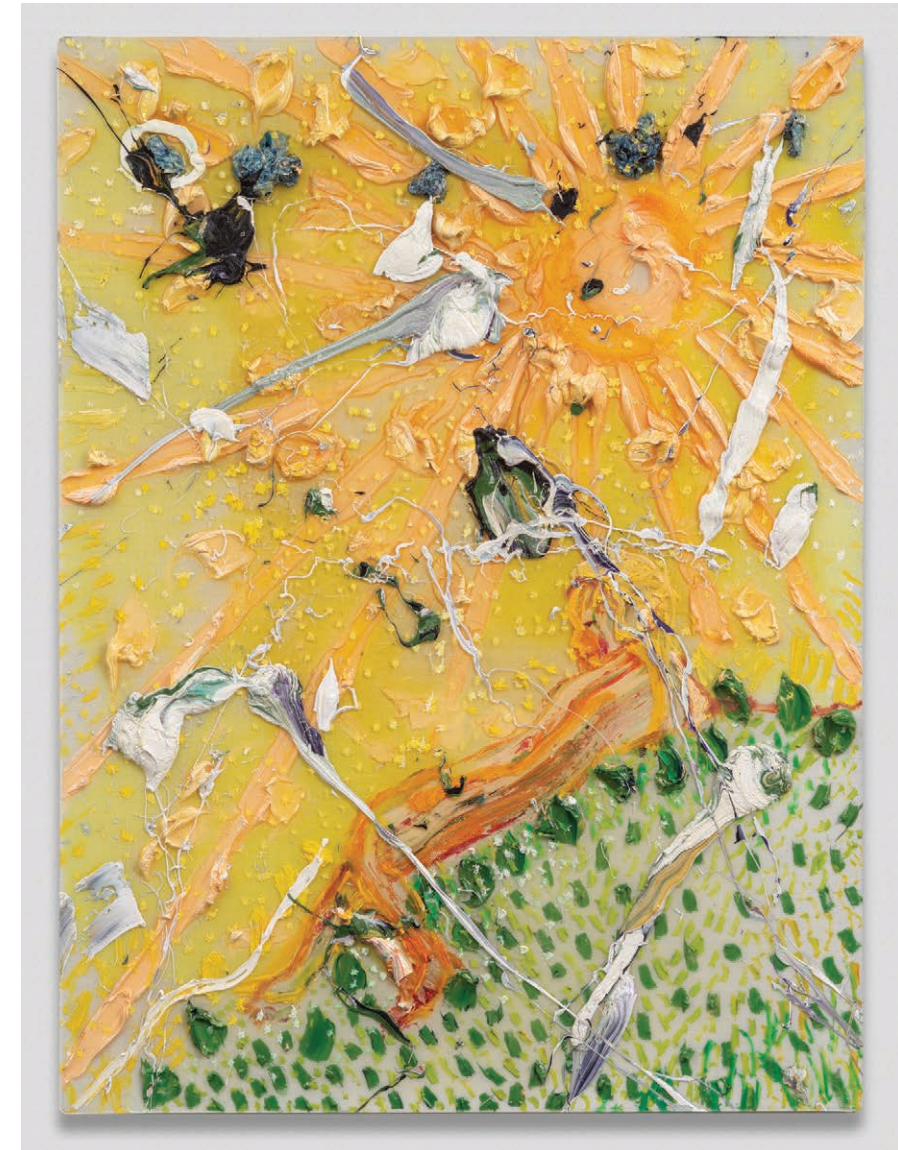
“On the Hill” 48 x 36 inches, Oil and Resin on Linen, 2022