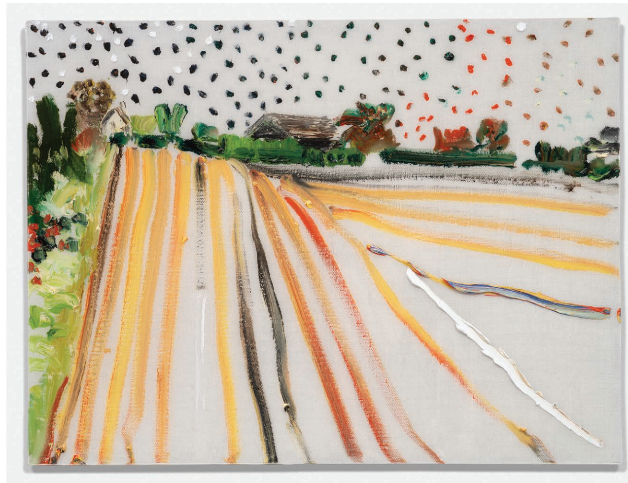
“Daniels Lane” 36 x 48 inches, Oil and Resin on Linen, 2022