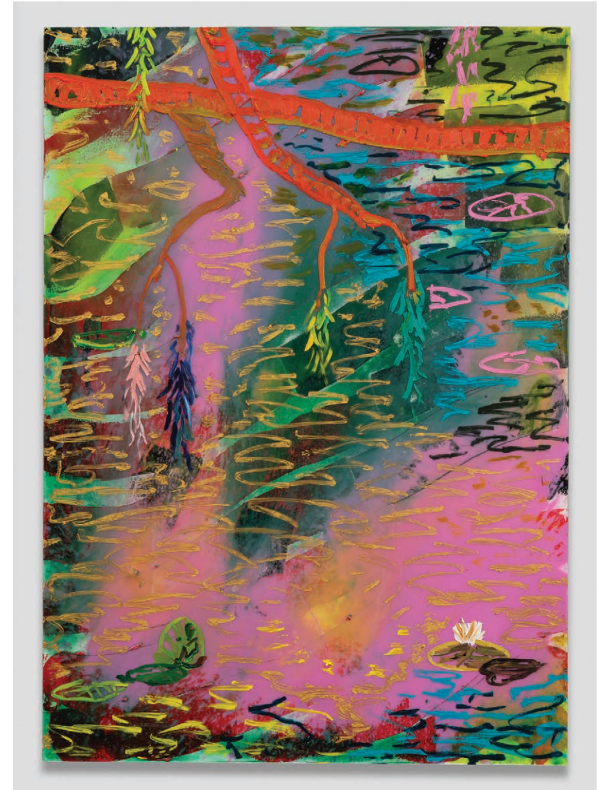
"Waterlilies on Pink Abstract" 77 x 55 inches, Oil, Acrylic and Resin on Linen, 2021