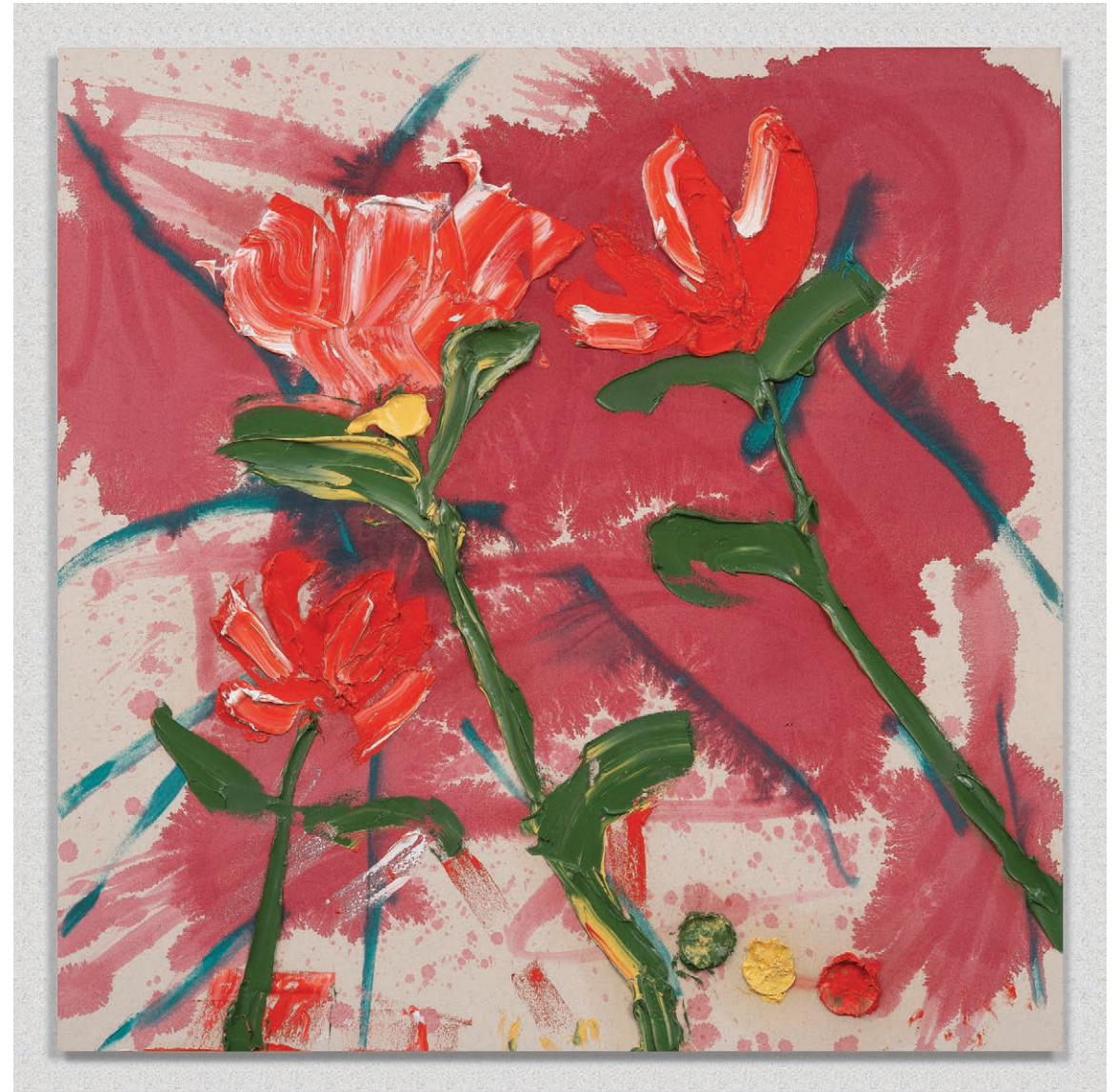
“Red on Red” 50 x 50 inches, Oil, Pastel and Resin on Canvas, 2022