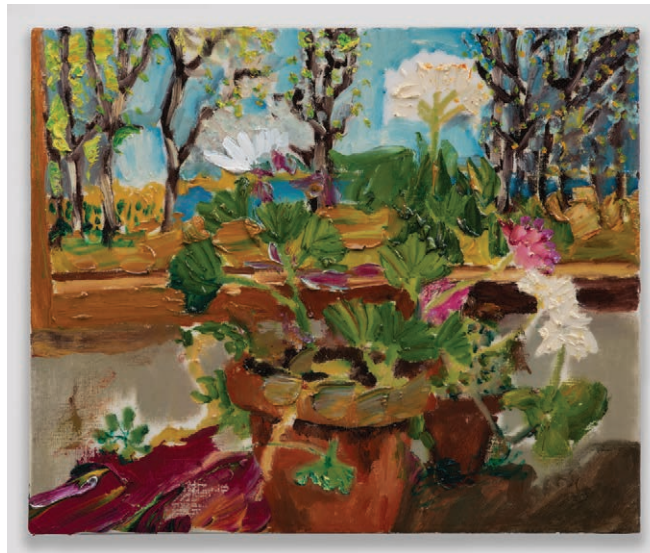
“Geraniums on Sag Pond” 20 x 24 inches, Oil and Resin on Linen, 2021