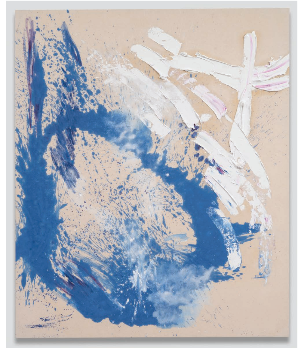
"Blue Spin" 72 x 60 inches, Oil on Canvas, 2021