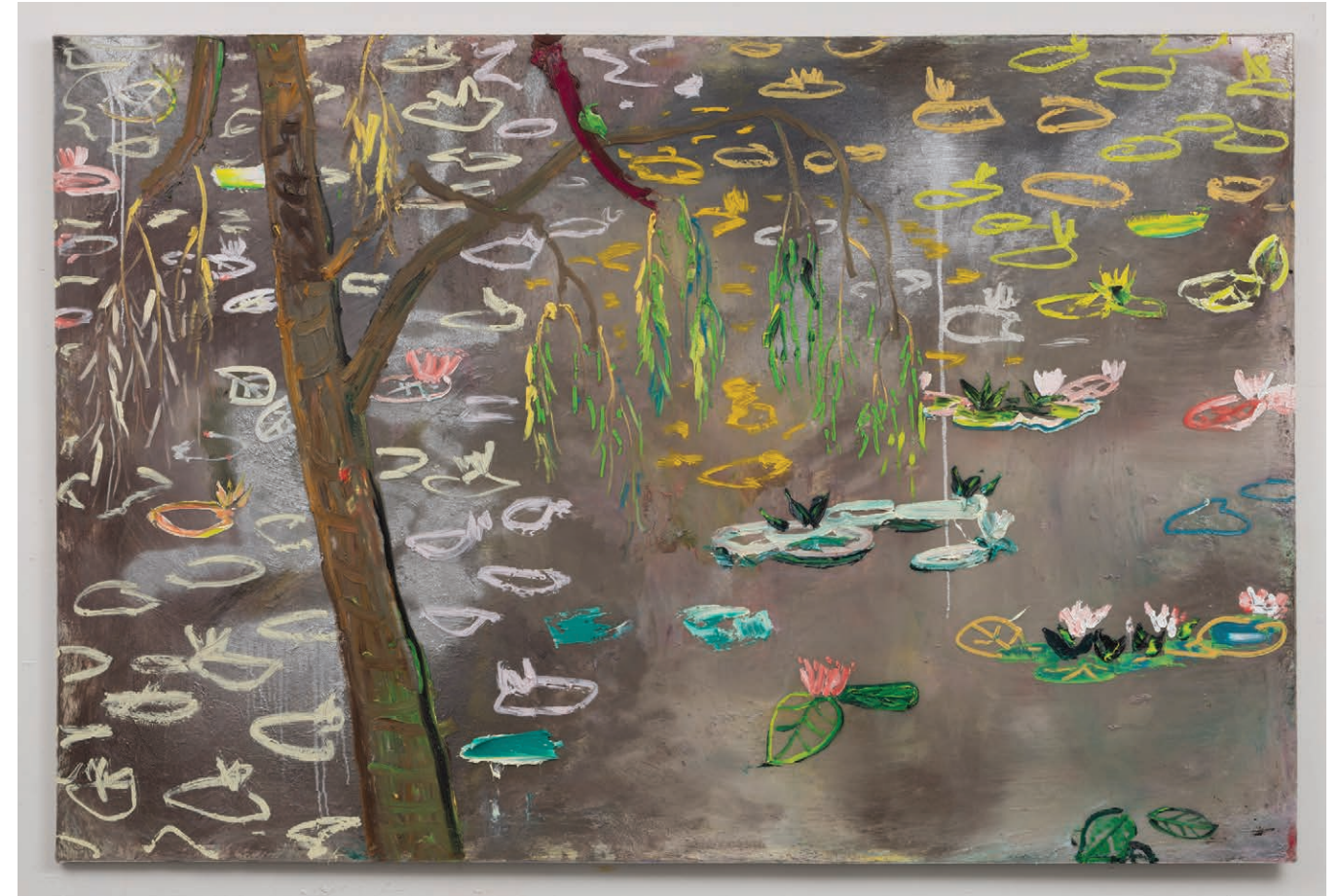
"Silver Pond" 72 x 108 inches, Oil and Resin on Linen, 2021