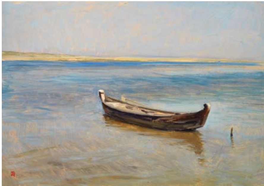
Fishing Boat on the Irrawaddy 10 x 14 inches, oil on panel, 2009