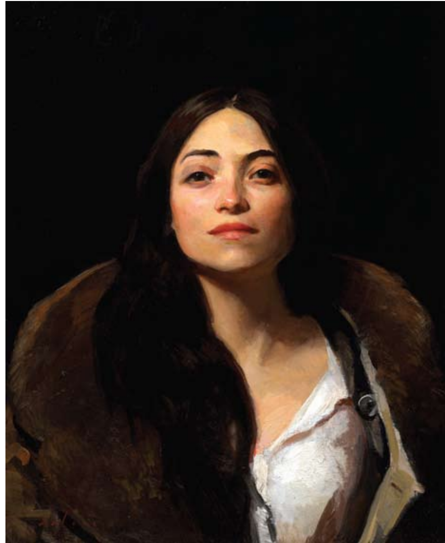
Candy 24 x 19 inches, oil on linen, 2009

Portrait Commissions Available. Please contact the Grenning Gallery for more information.