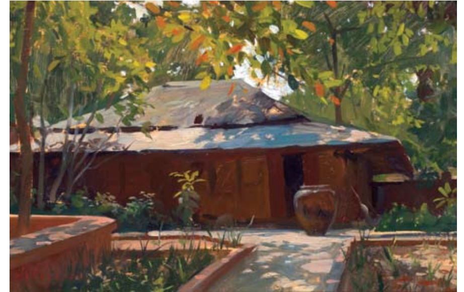
Auntie's House 8 x 12 inches, oil on panel, 2009