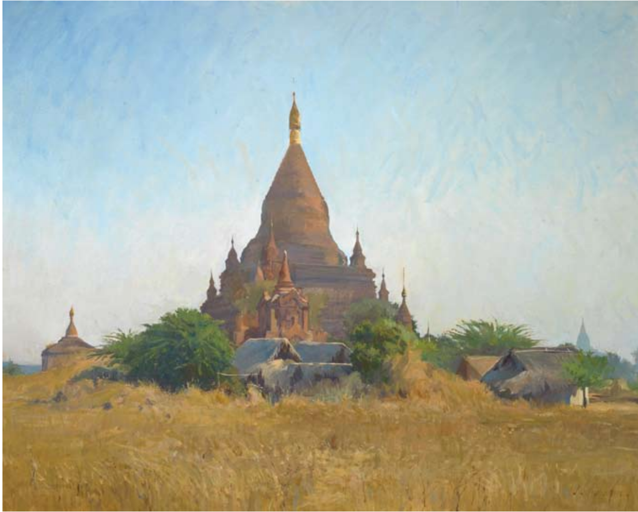
Soe-min-gyi Pagoda 39 x 32 inches, oil on linen, 2009