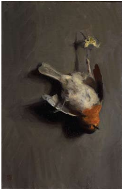
Robin 12 x 8 inches, oil on linen, 2008