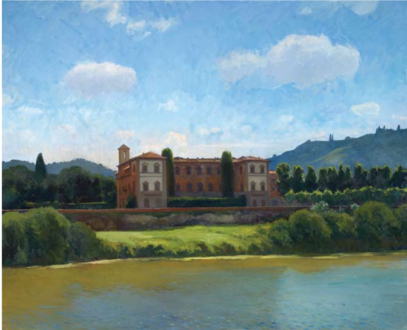
Palazzo Serristori 35 x 43 inches, oil on linen, 2009