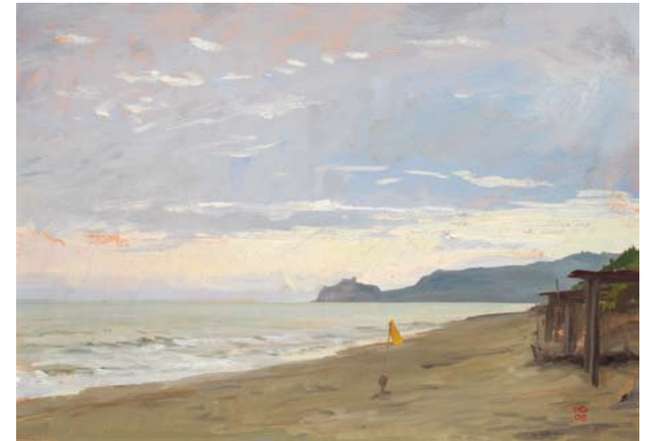
Afternoon at Roccamare 10 x 14 inches, oil on panel, 2008