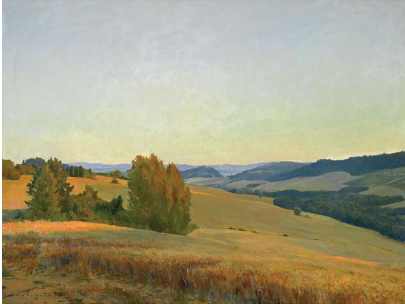
Wheat fields at Sosta del Papa 70 x 54 inches, oil on linen, 2008