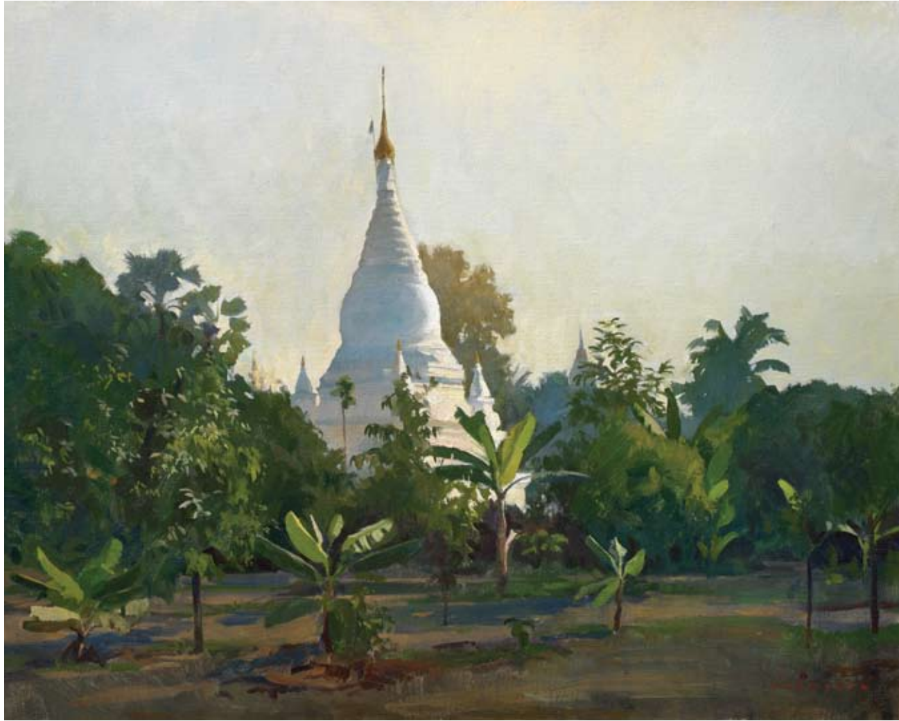
Banana Trees 16 x 20 inches, oil on linen, 2009