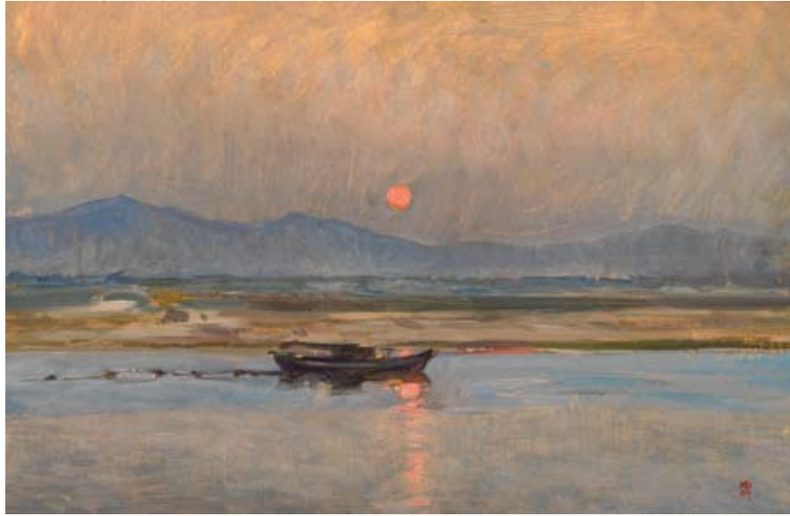
Dusk 8 x 12 inches, oil on panel, 2009