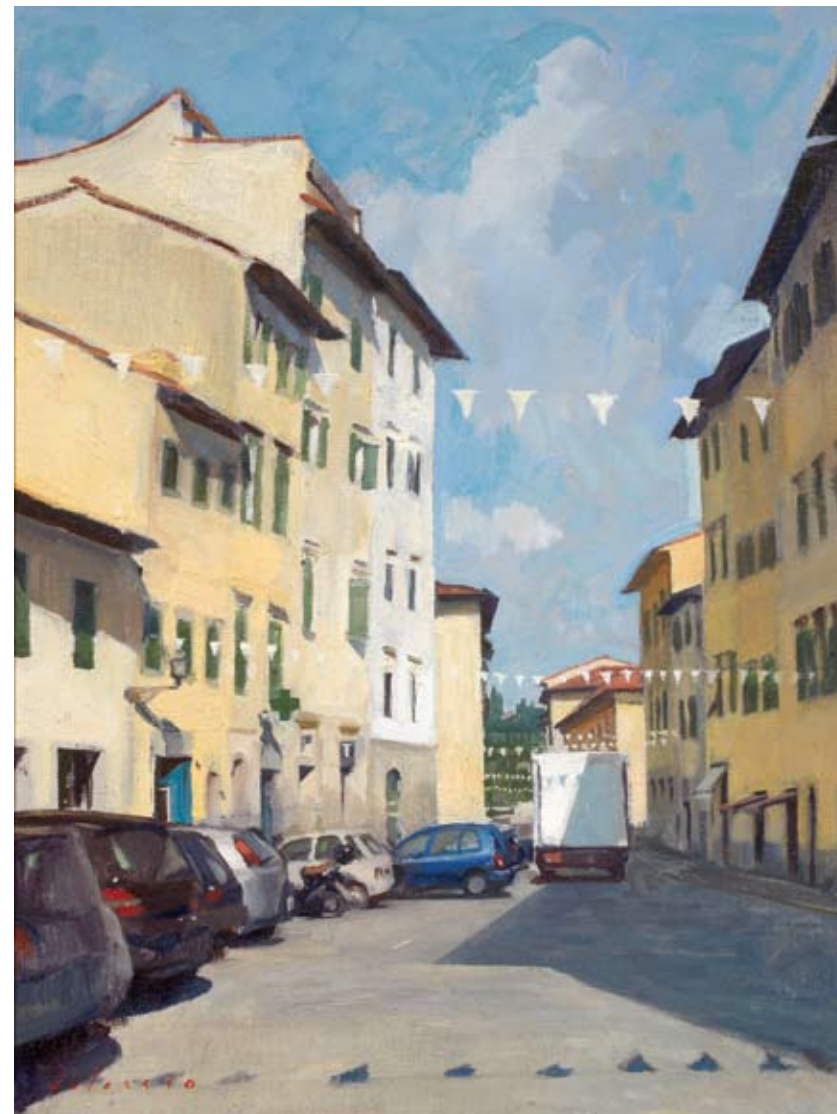
Piazza Piattellina 16 x 12 inches, oil on linen, 2008