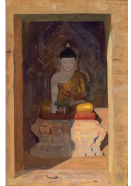
Buddha Statue, Bagan 12 x 8 inches, oil on panel, oil on panel, 2009