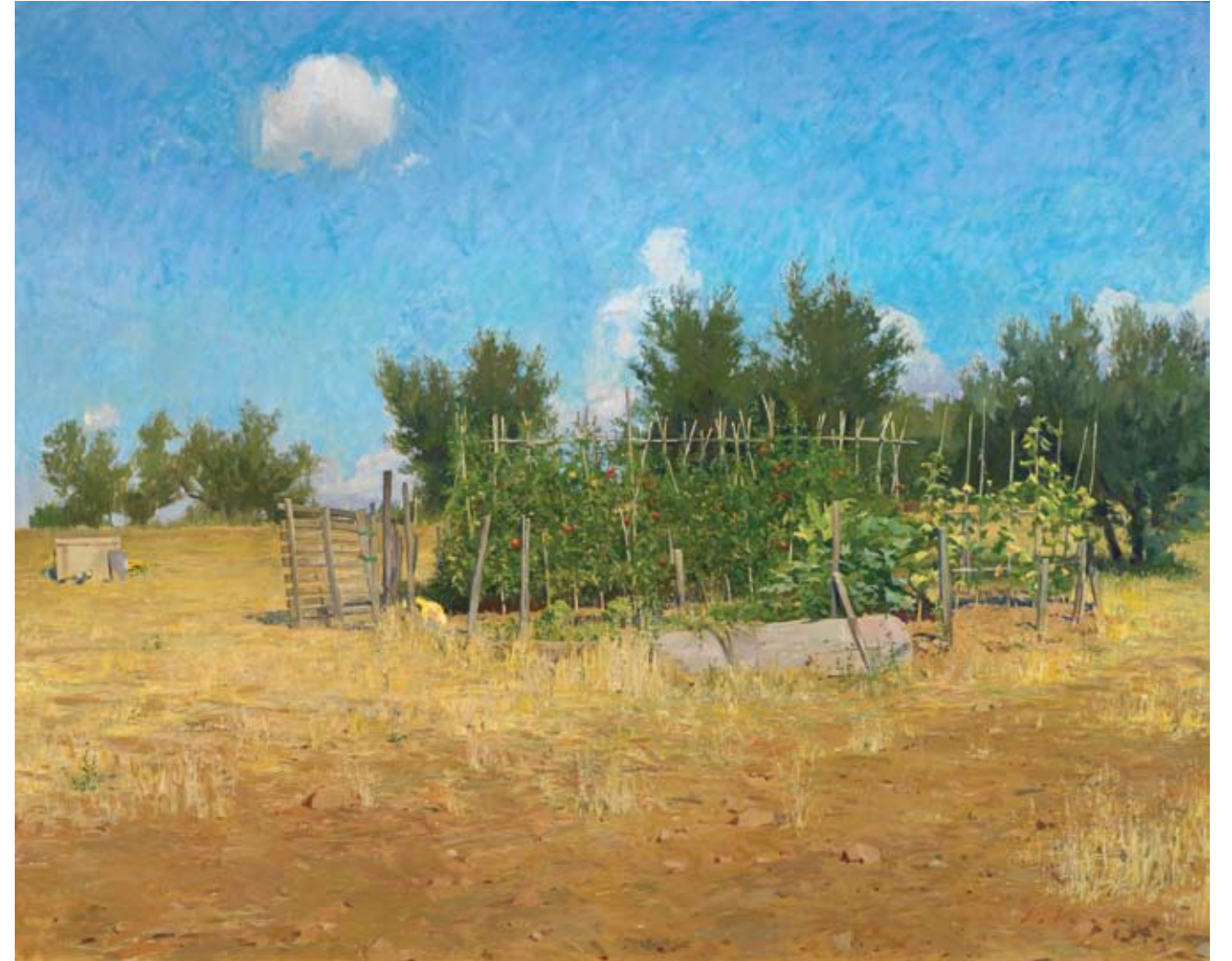
In the Face of All Aridity 47 x 58 inches, oil on linen, 2008