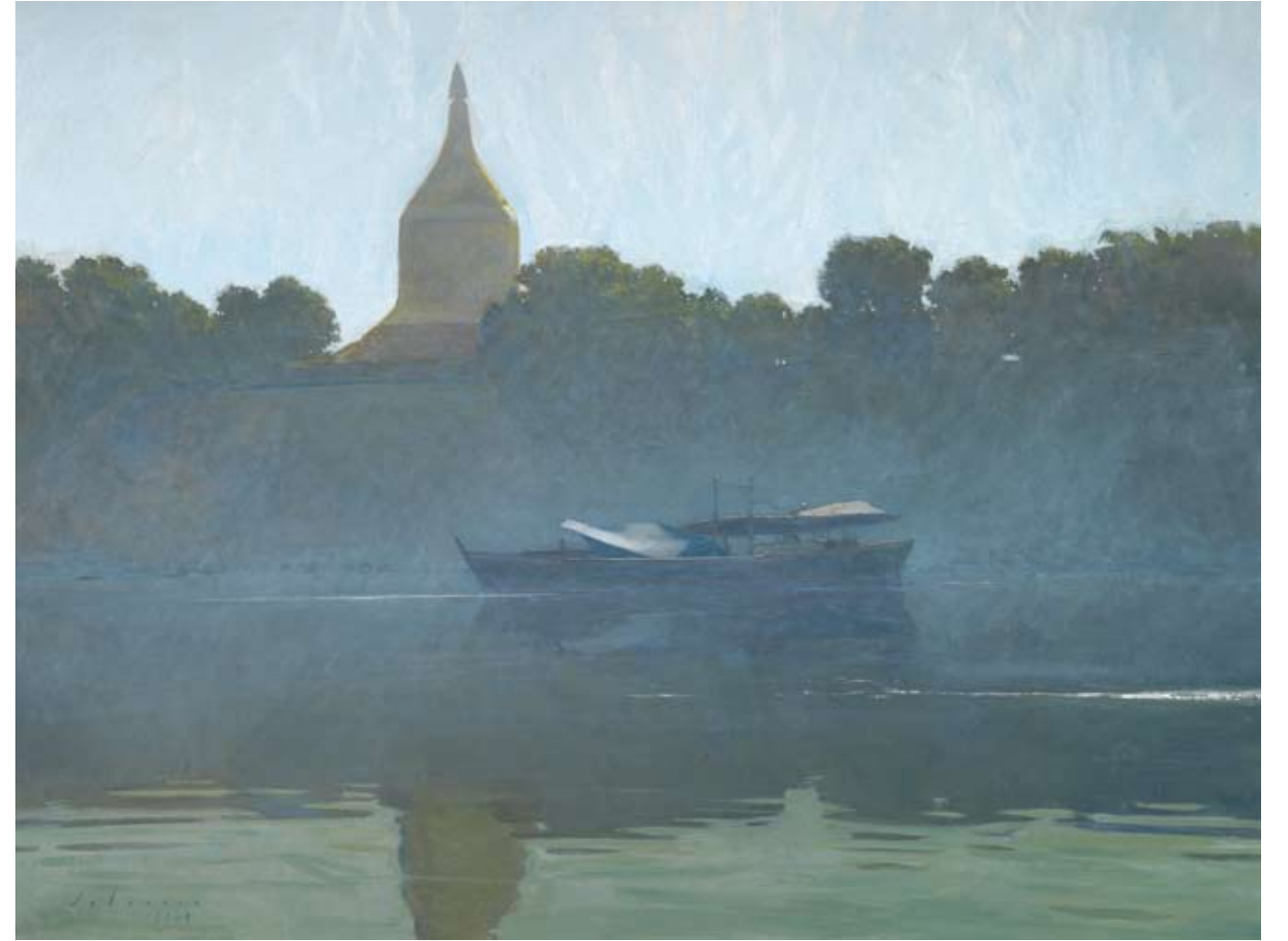
Morning on the Irrawaddy 35 x 43 inches, oil on linen, 2009