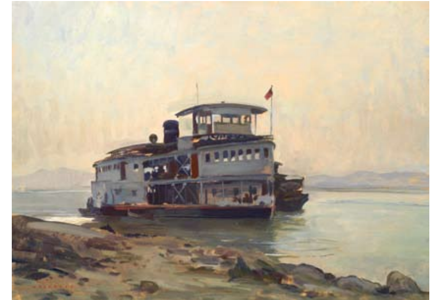
Irrawaddy Princess 10 x 14 inches, oil on panel, 2009