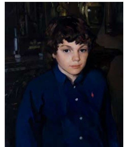
Max. Oil on linen, 28 x 20 inches, 2007