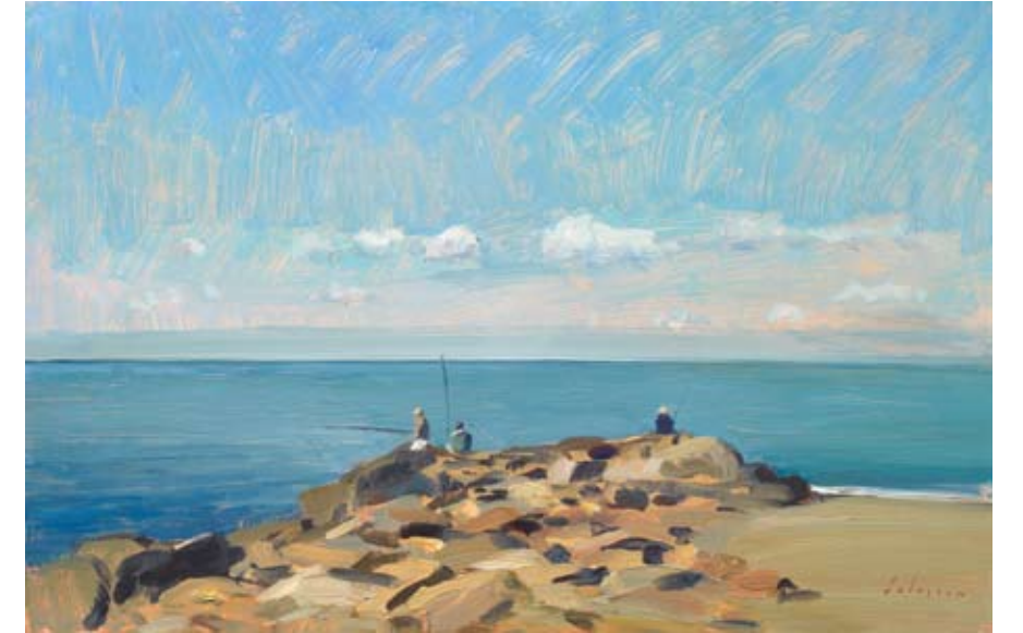
Fishermen, Marina di Cecina 8 x 12 inches, oil on panel, 2008