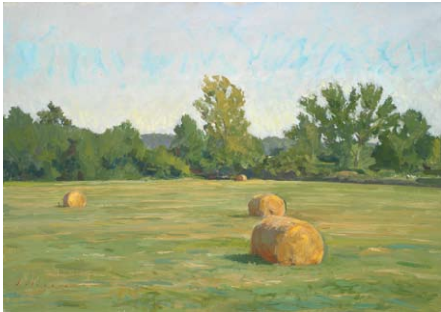
Haybales, Colle val d'Elsa 27 x 20 inches, oil on linen, 2008