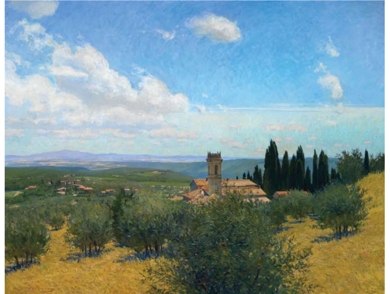
Monti 70 x 54 inches, oil on linen, 2009