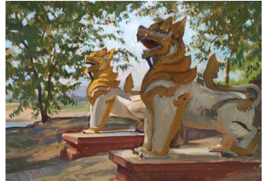
Chinthe of Lawkananda Paya 10 x 14 inches, oil on panel, 2009