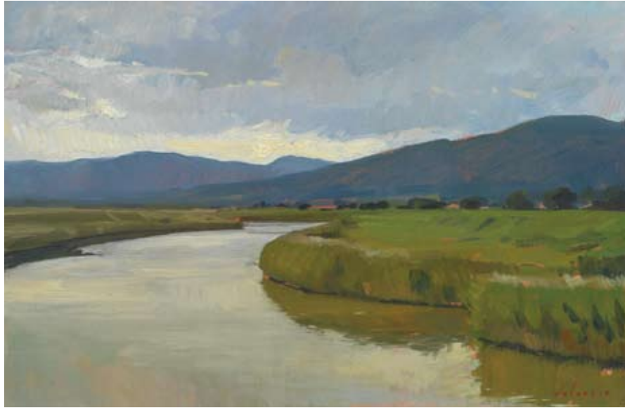
The Bruna 8 x 12 inches, oil on panel, 2008