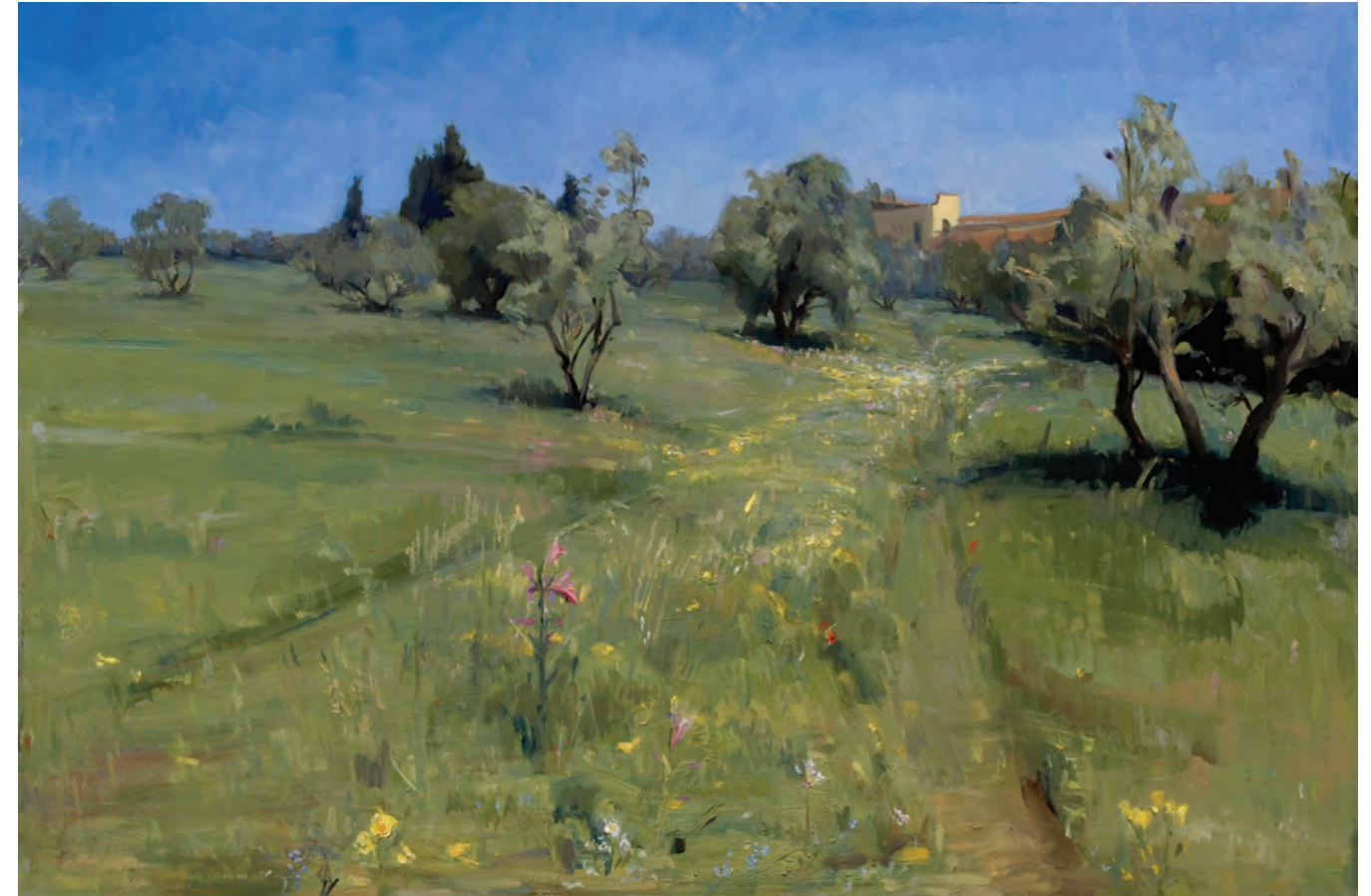
“Forget-Me-Not” Sanchez | 19.6 x 29.5 | Oil | 2016