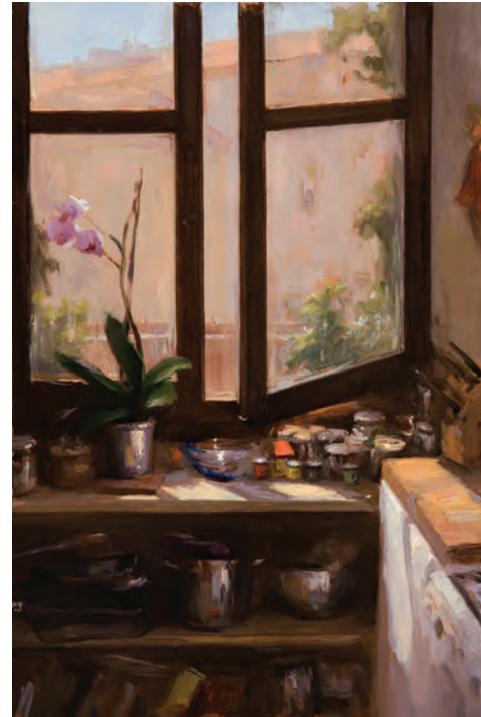
“Spices” Sanchez 12 x 8 | Oil 2016