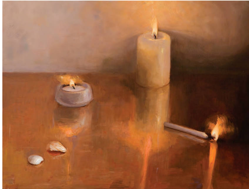
"Memories" Sanchez 9.8 x 12.5 | Oil 2016