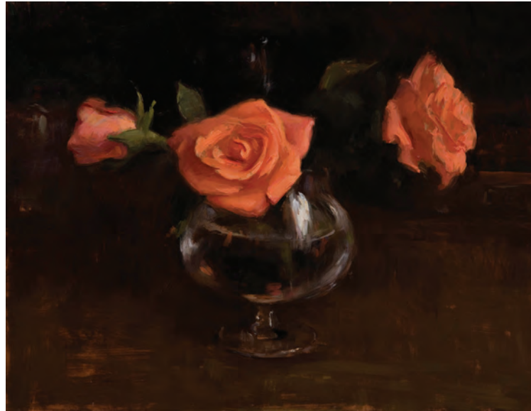
“Roses” Sanchez 10 x 13 | Oil 2015