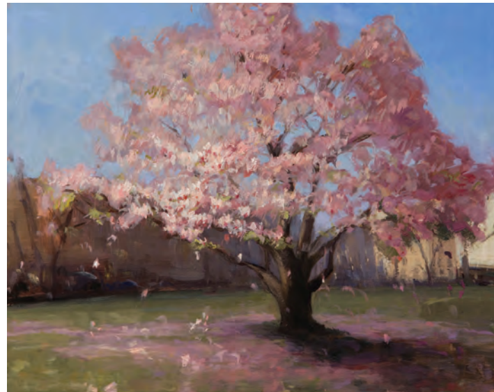
"Magnolia" Sanchez 8 x 10 | Oil 2015