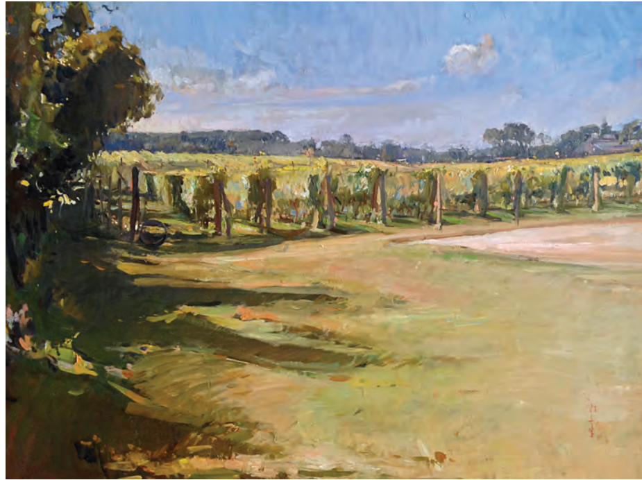
“Channing Daughter’s Vineyards” Ramiro 23.5 x 31.5 | Oil 2015