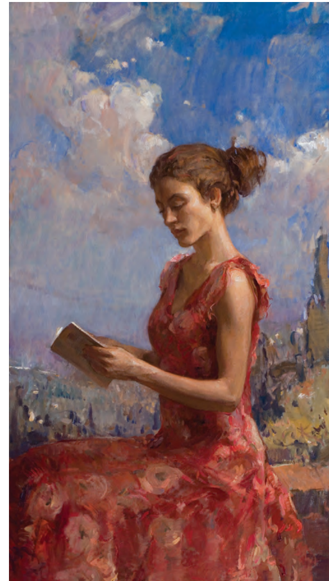
“Sonnet” Ramiro | 54 x 30.7 | Oil | 2016