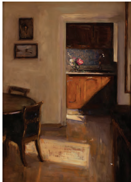
“Summer Light” Sanchez 9.5 x 7 | Oil 2016