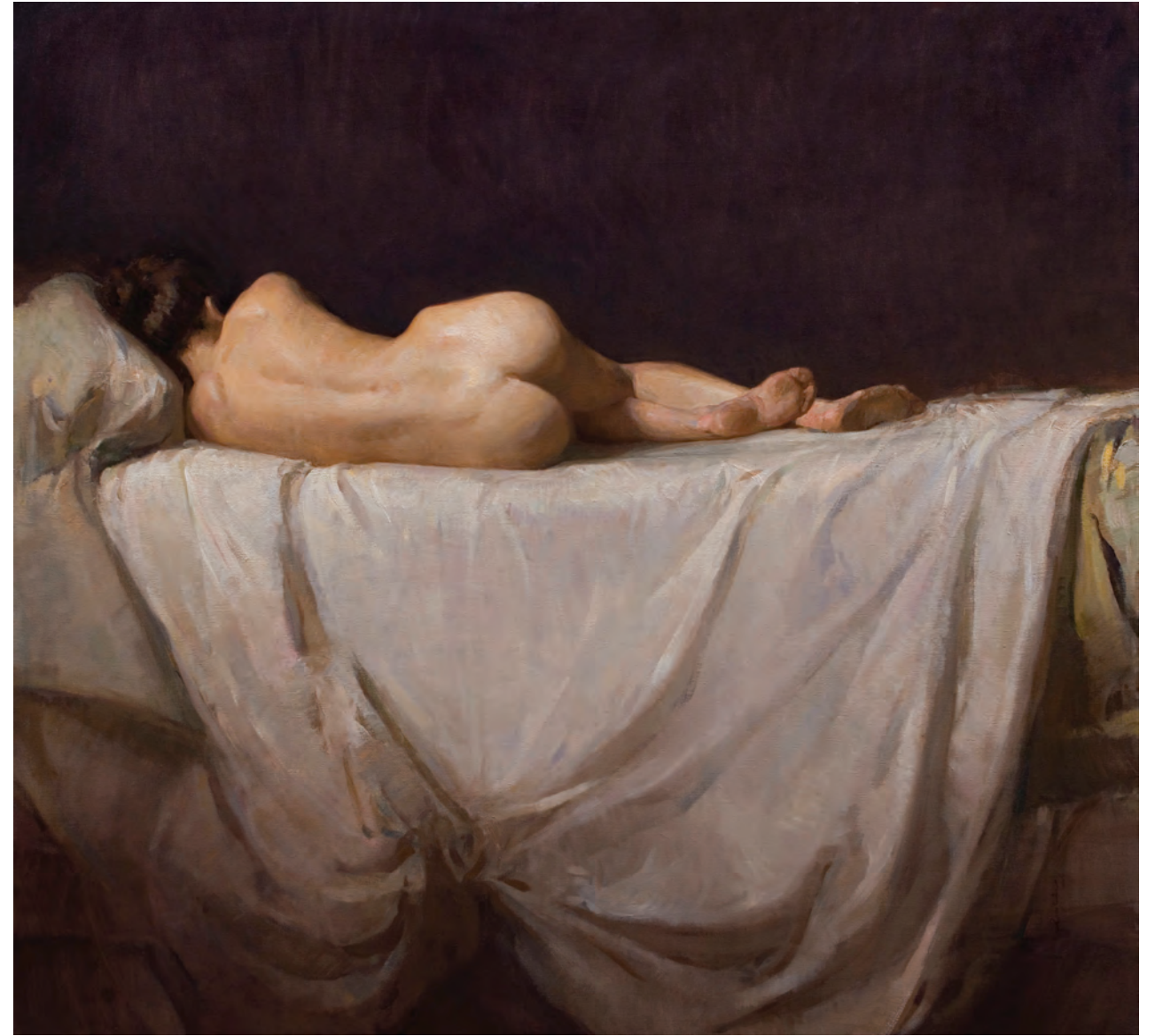
"Nude" Ramiro | 51 x 47 | Oil | 2015