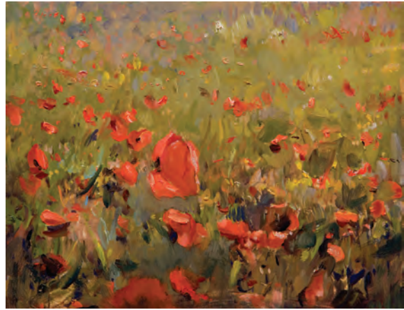
"Papaveri" Ramiro 7.8 x 9 | Oil 2016