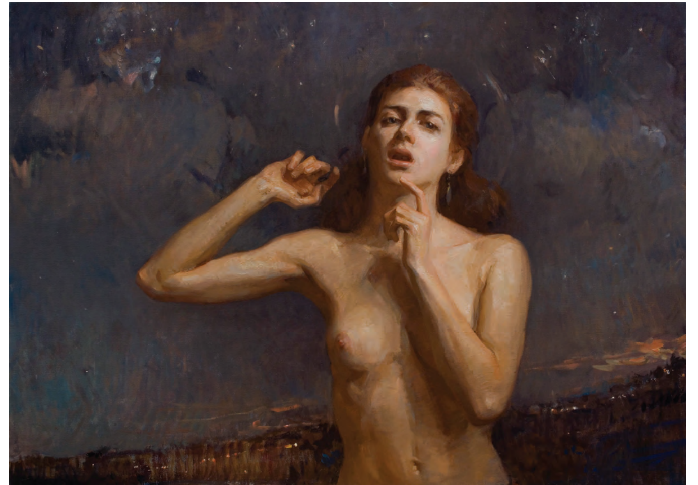
"Allegory of Chopin (Nocturne)" Ramiro | 29.5 x 41.5 | Oil | 2015