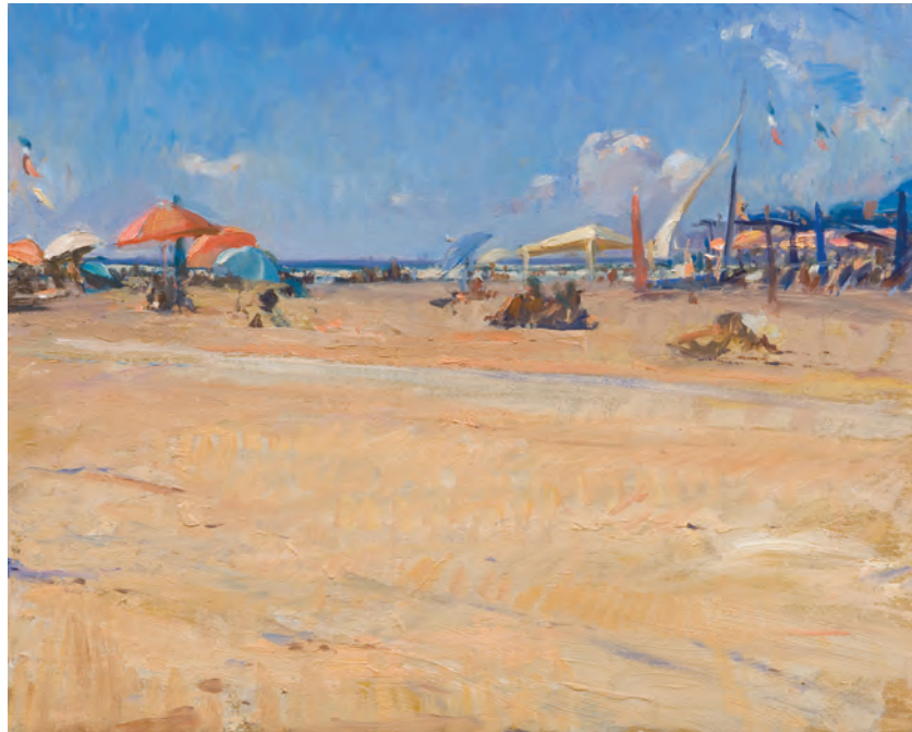
"Beach Scene Viareggio" Ramiro 15.75 x 19.6 | Oil 2016