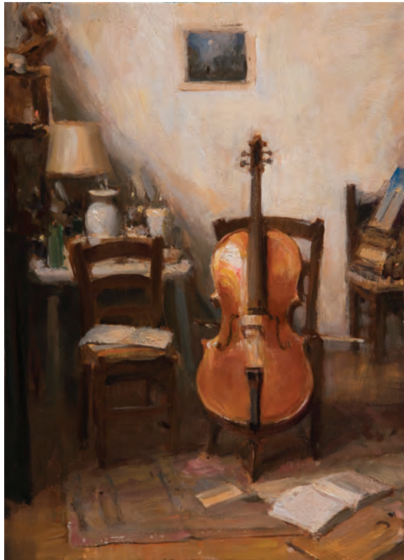
"Cello Interior" Ramiro | 14 x 10 | Oil | 2015