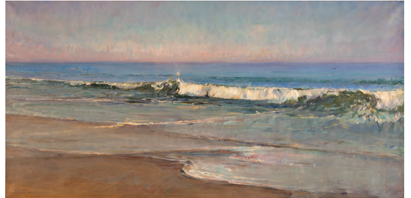
“Evening Ocean” Ramiro | 32 x 63 | Oil | 2014