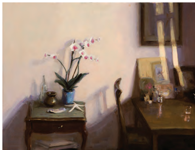
“Studio” Sanchez 8 x 10 | Oil 2014