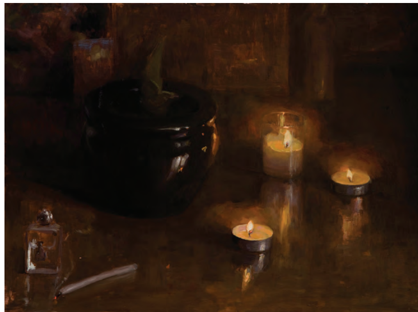
“Quiet Hopes” Sanchez 12 x 16 | Oil 2015