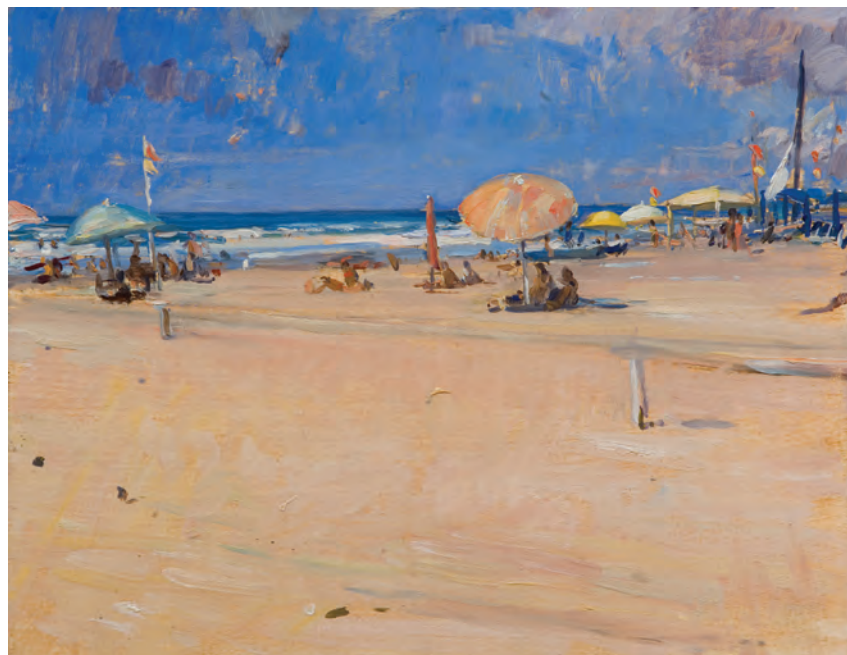
“Orange Umbrella” Ramiro | 13.8 x 17.7 | Oil | 2016