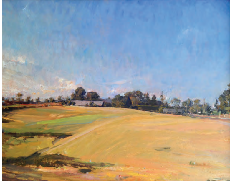
“Farm, Mecox Bay” Ramiro | 16 x 20 | Oil | 2016