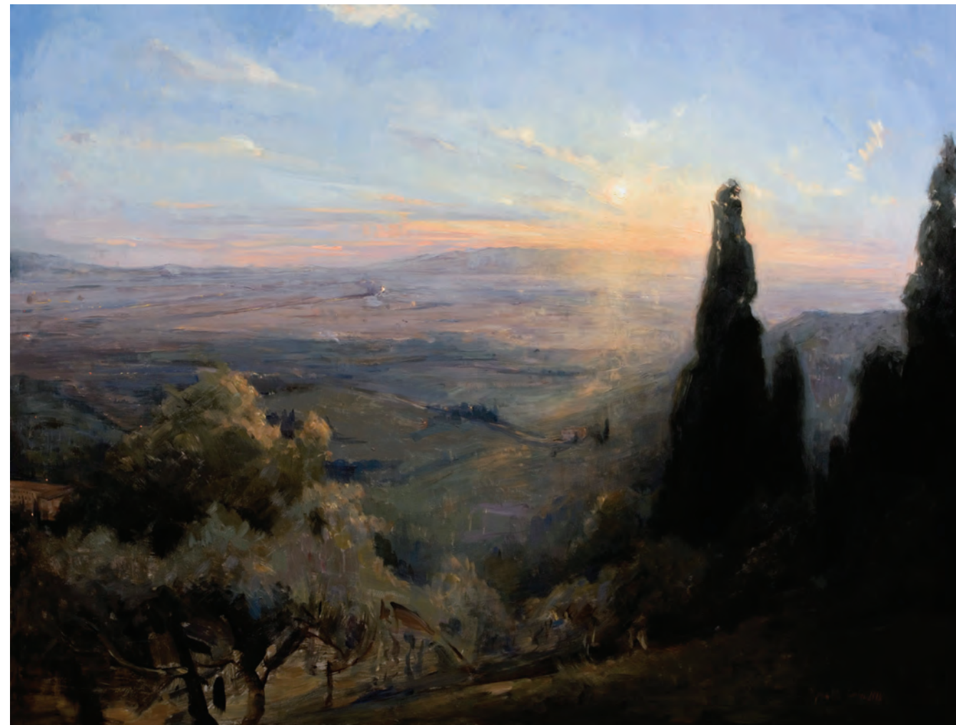
“Fiesole Sunset” Sanchez | 29.5 x 39.3 | Oil | 2016