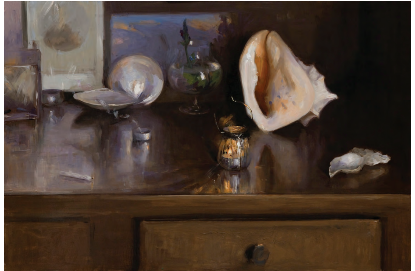
"Remember Me" Sanchez | 19.6 x 29.5 | Oil | 2016