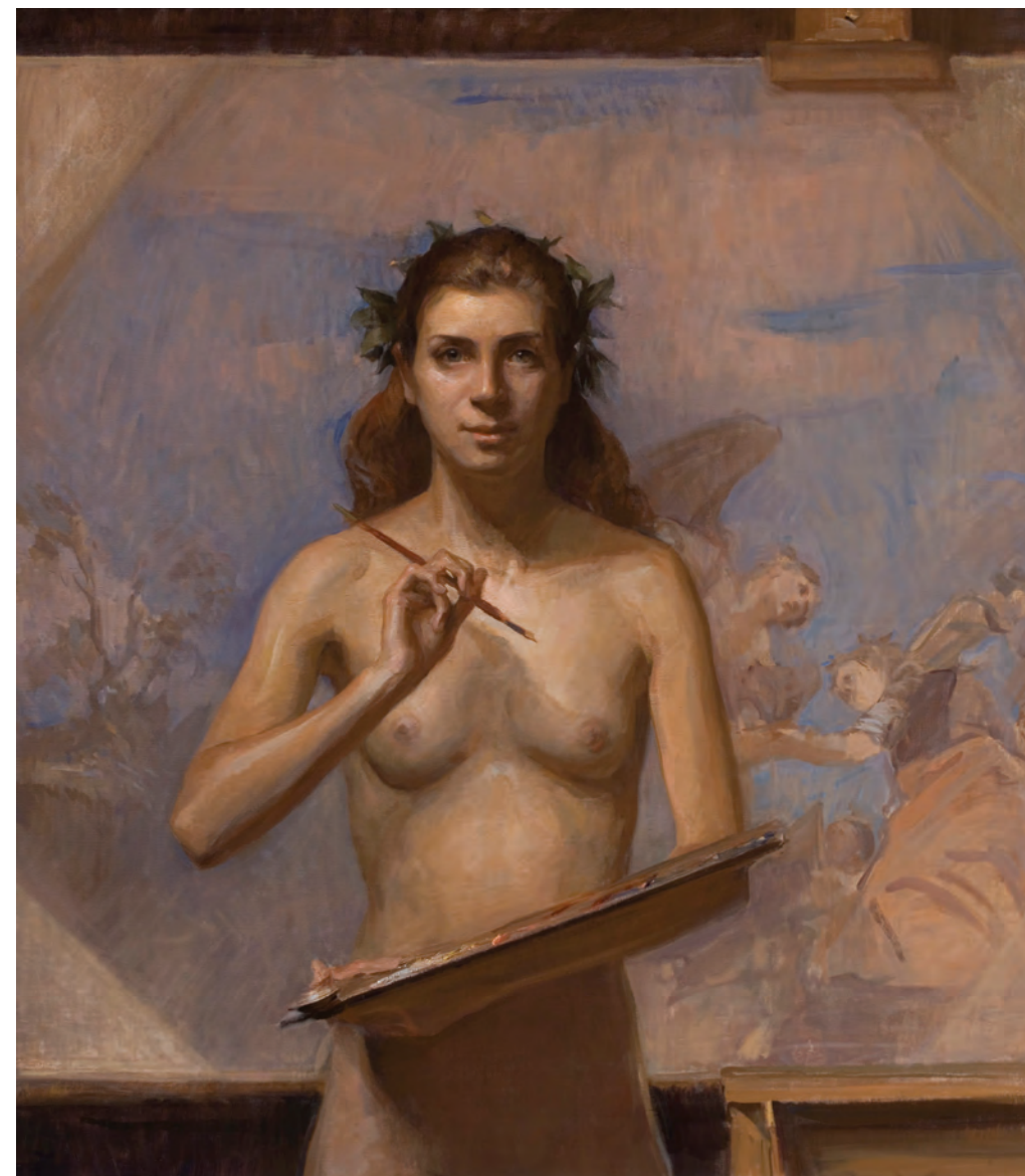
“Allegory of Painting” Ramiro | 41.3 x 37.4 | Oil | 2016