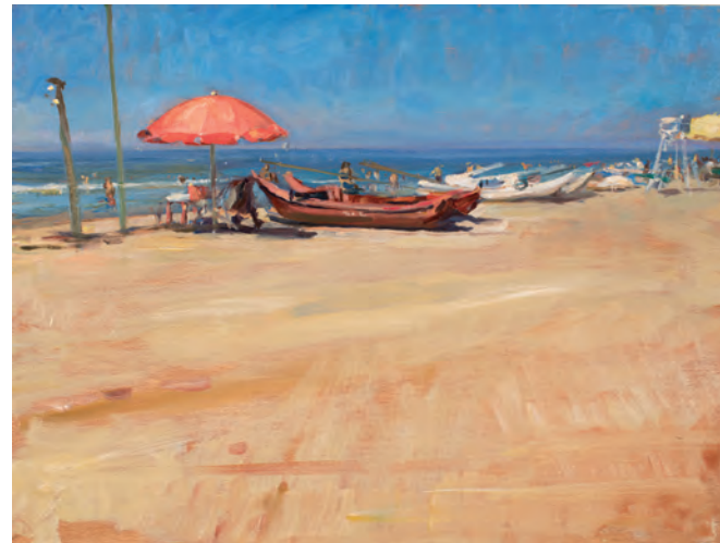
“Lifeguard, Pietrasanta” Ramiro 12 x 16 | Oil 2016