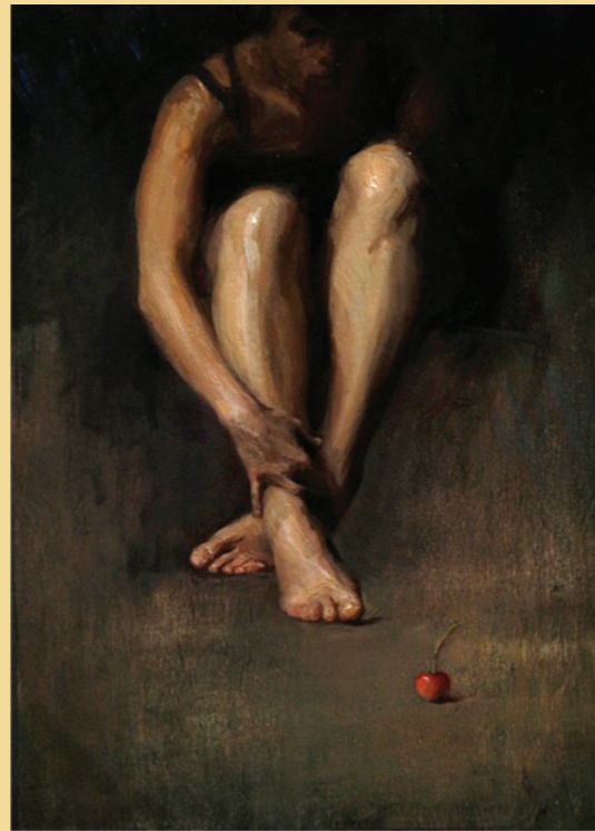
"Cherry" by Ramiro, 13.75 x 9.75 inches, Oil, 2013