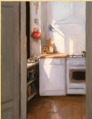
“Minutes” by Melissa Franklin - Sanchez, 8.5 x 6.5 inches, Oil, 2013