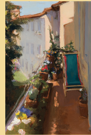
“Balcony” by Melissa Franklin - Sanchez, 6.5 x 4.5 inches, Oil, 2013