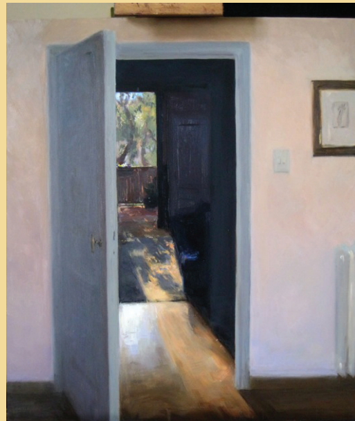
“Winter Light” by Melissa Franklin - Sanchez, 19.5 x 17 inches, Oil, 2013