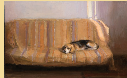
“9 am” by Melissa Franklin - Sanchez, 4.5 x 6.5 inches, Oil, 2013