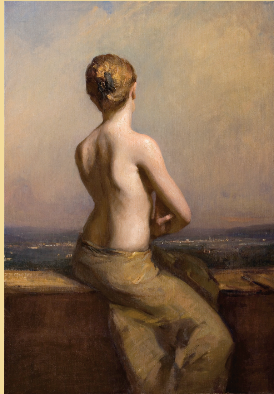
"Fiesole" by Ramiro, 51 x 35 inches, Oil, 2013