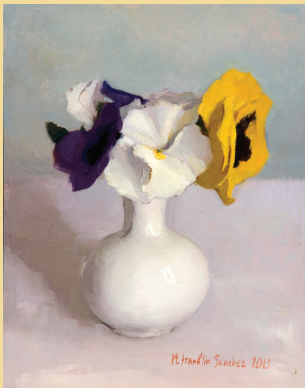
“Pansies” by Melissa Franklin - Sanchez, 8.5 x 6.5 inches, Oil, 2013