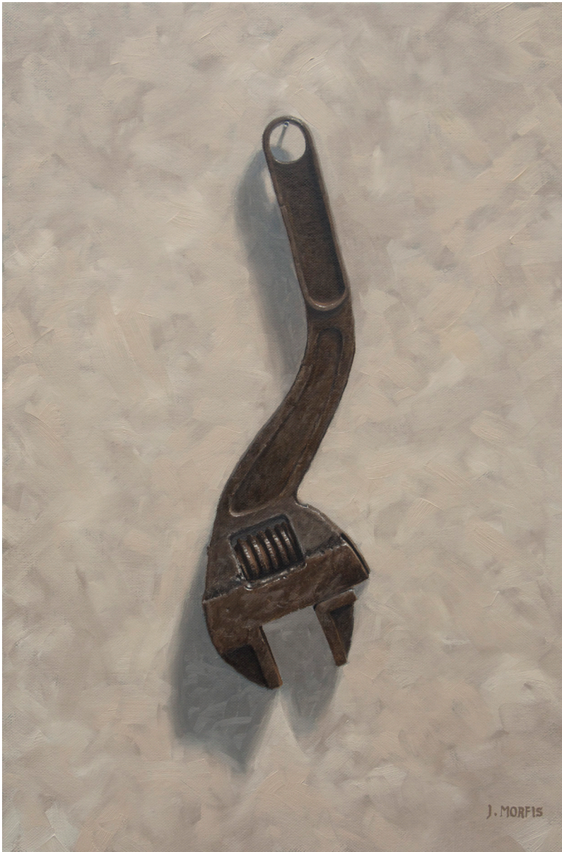
“The Curvy Wrench”