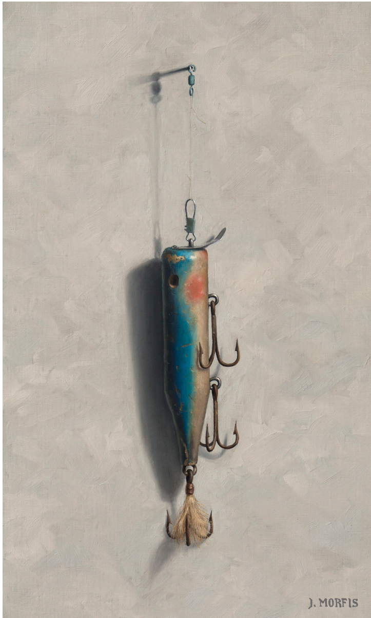
“Blind in One Eye”