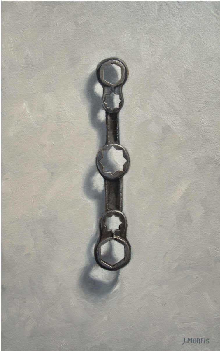
“Ford Model T Wrench”