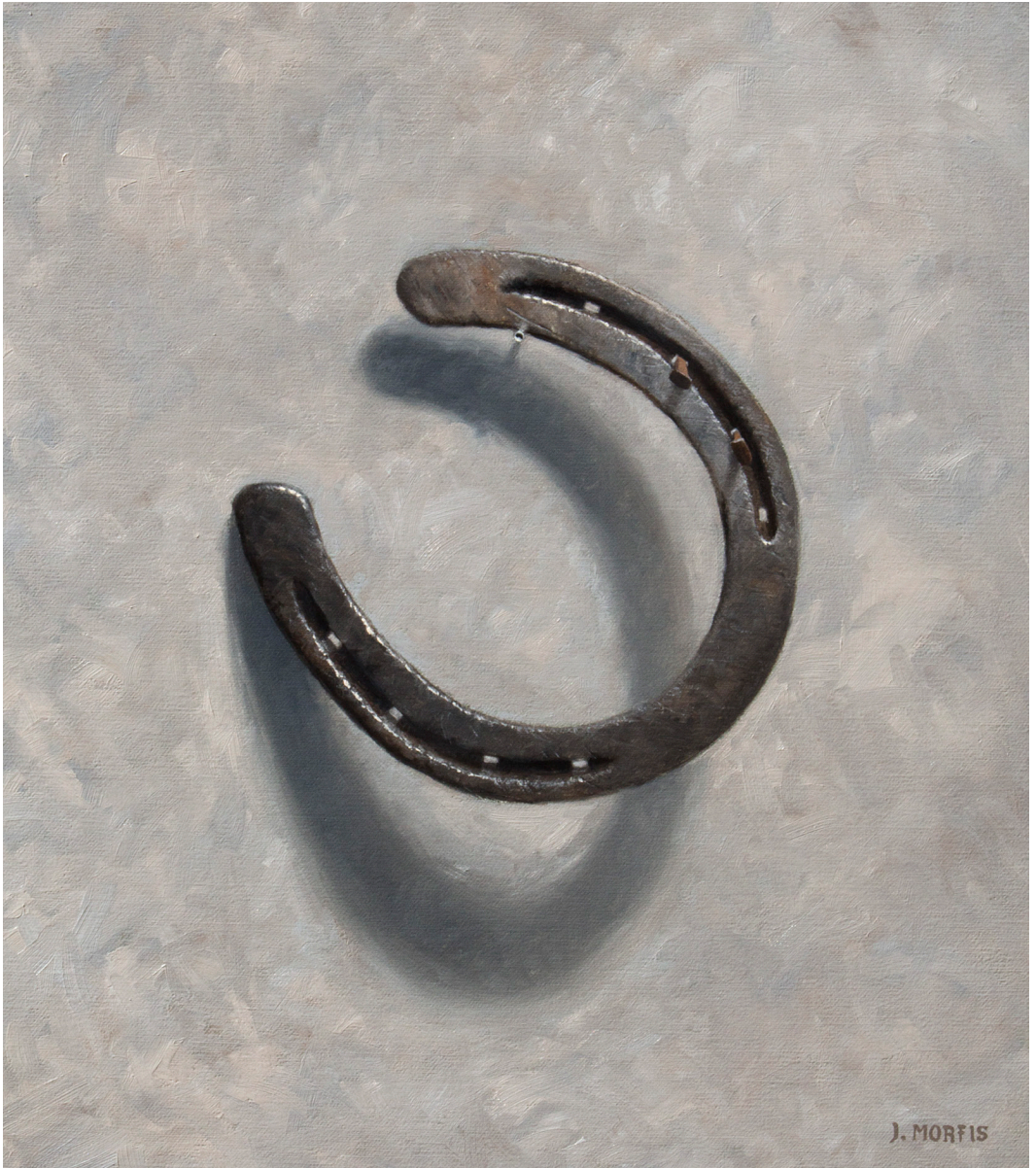
“Aristocrat’s Near Luck”