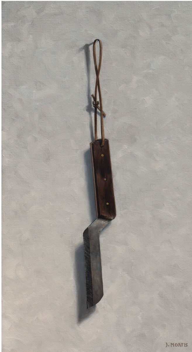
“Meriden Cutlery 1870”