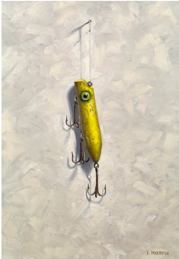
“Todd’s Yellow Lure”

John Morfis | 13 x 9 | Oil on Linen | 2015