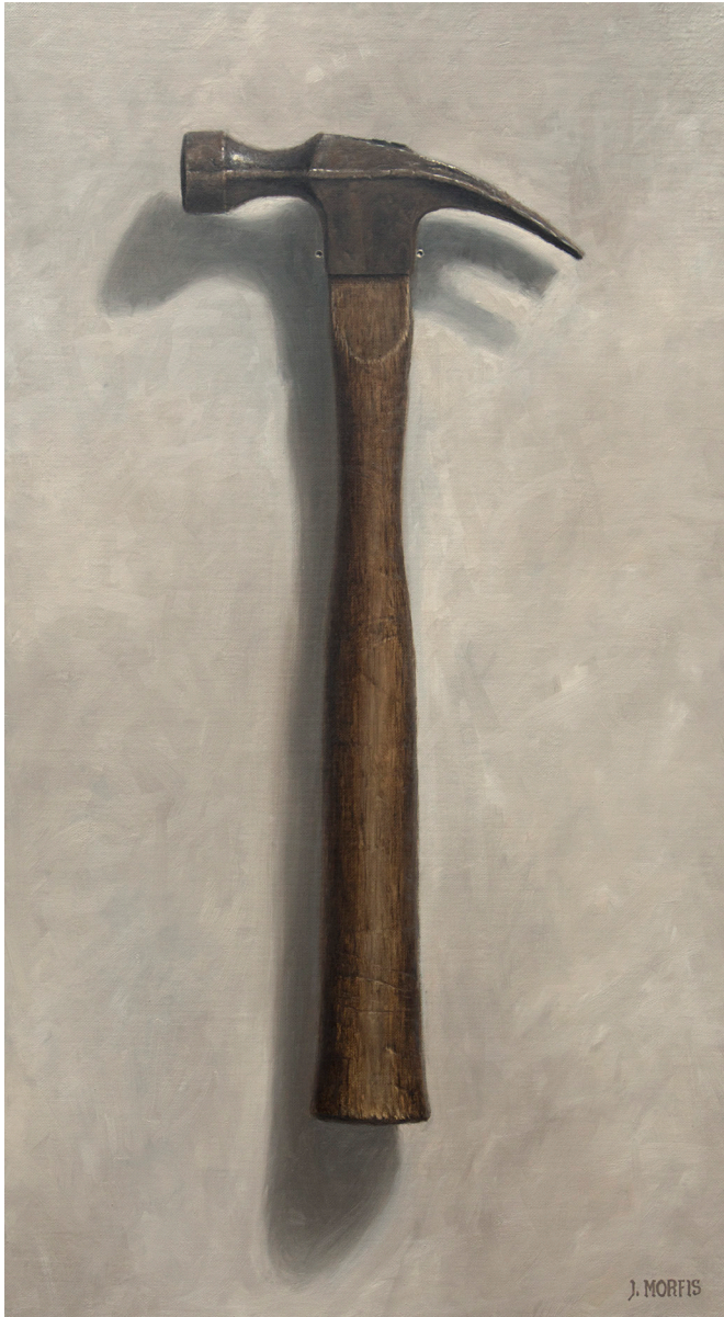
“Old Cast Hammer”