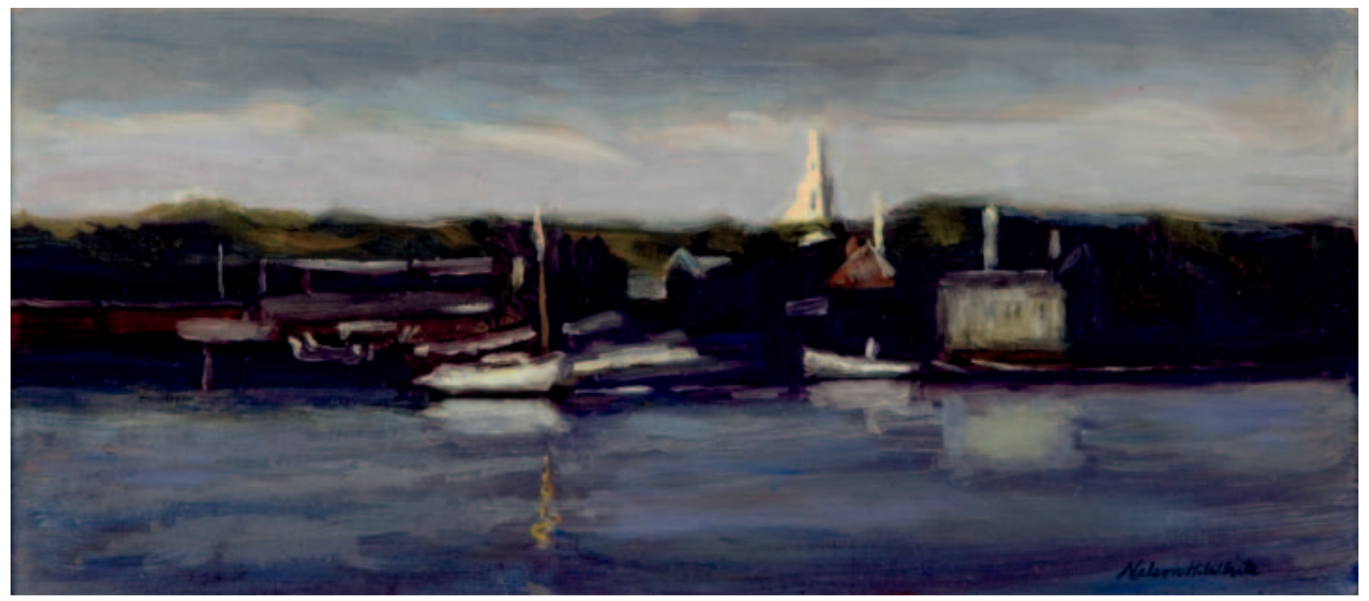
Nantucket Harbor 5.25 x 11.75 Inches Oil On Canvas, 2005