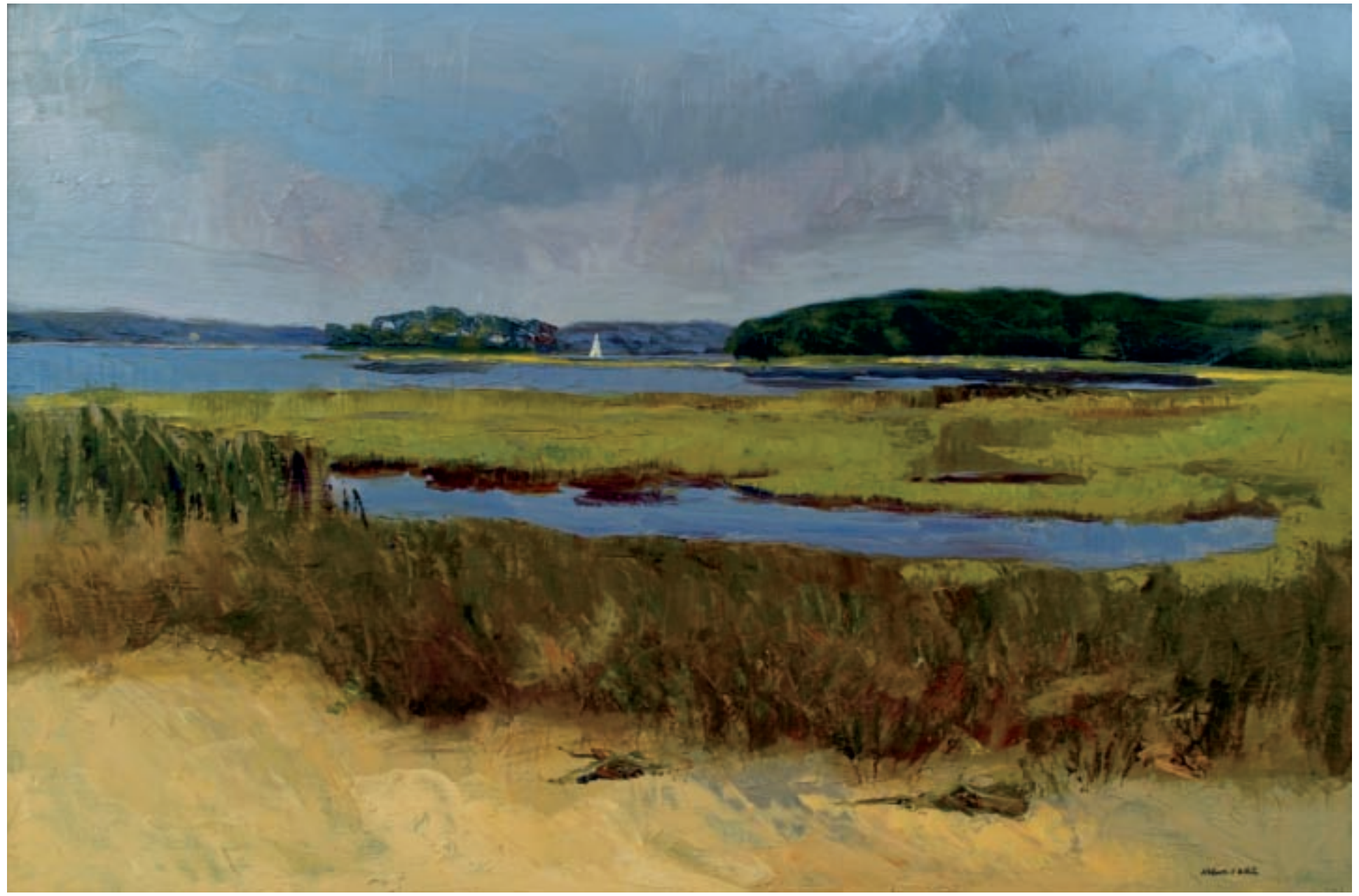
Mashomack Point 24 x 36 Inches Oil On Canvas, 2007