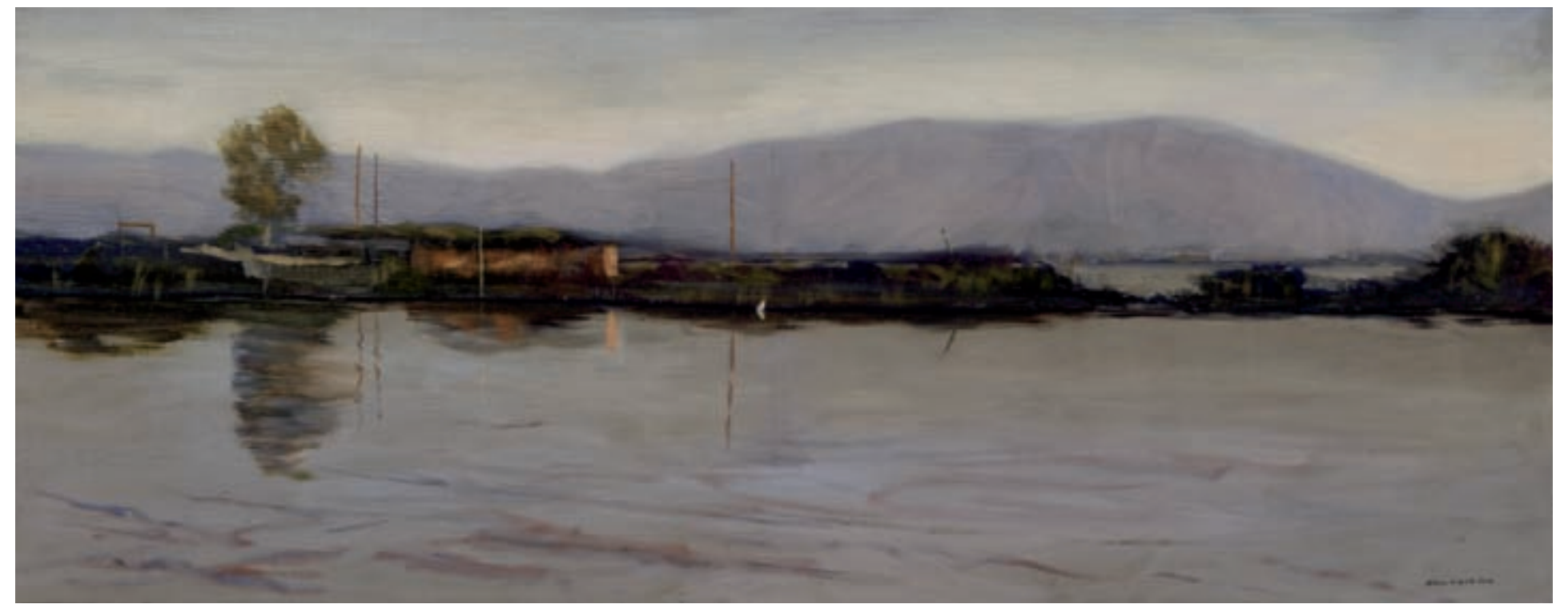
Torre Del Lago Puccini 20 x 48 Inches Oil On Canvas, 2007