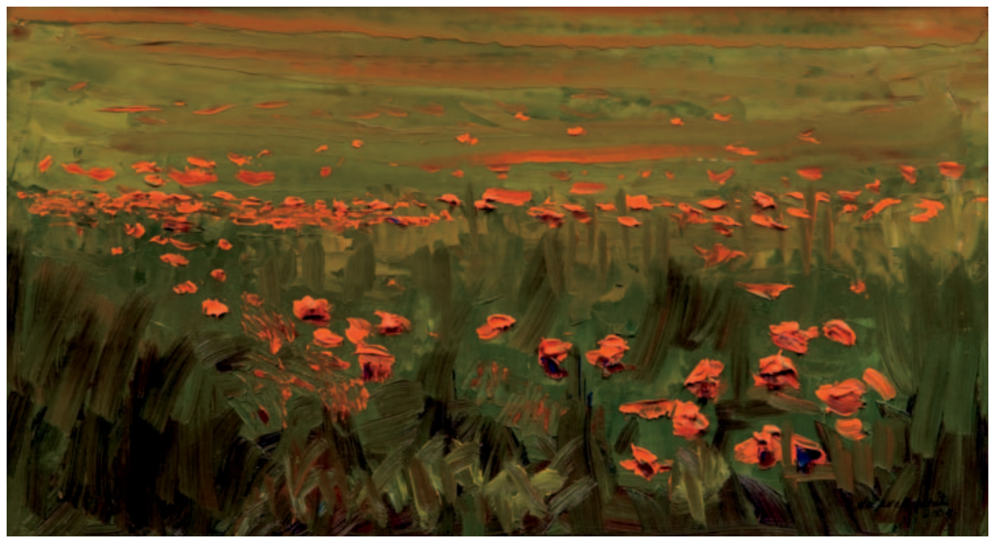
The Poppy Field 9 x 16 Inches Oil On Canvas, 2008