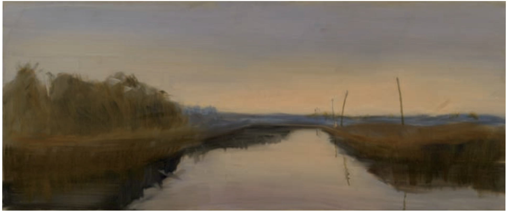
Evening on the Canal 20 x 48 Inches Oil On Canvas, 2007