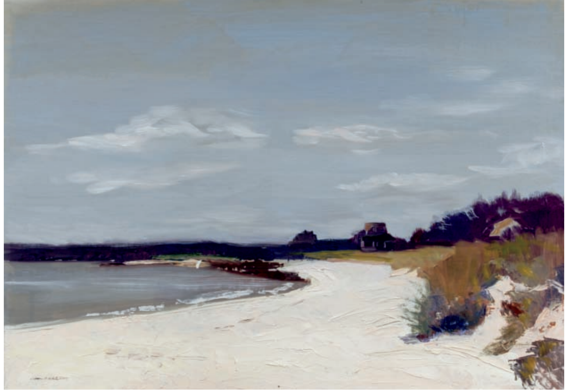
Waterford Front Beach 20 x 29 Inches Oil On Canvas, 2007