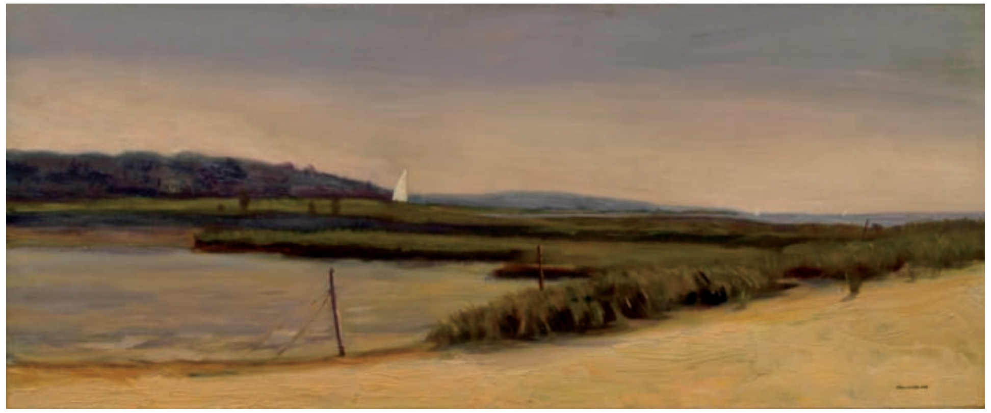
Noyac, N.Y. 20 x 48 Inches Oil On Canvas, 2008