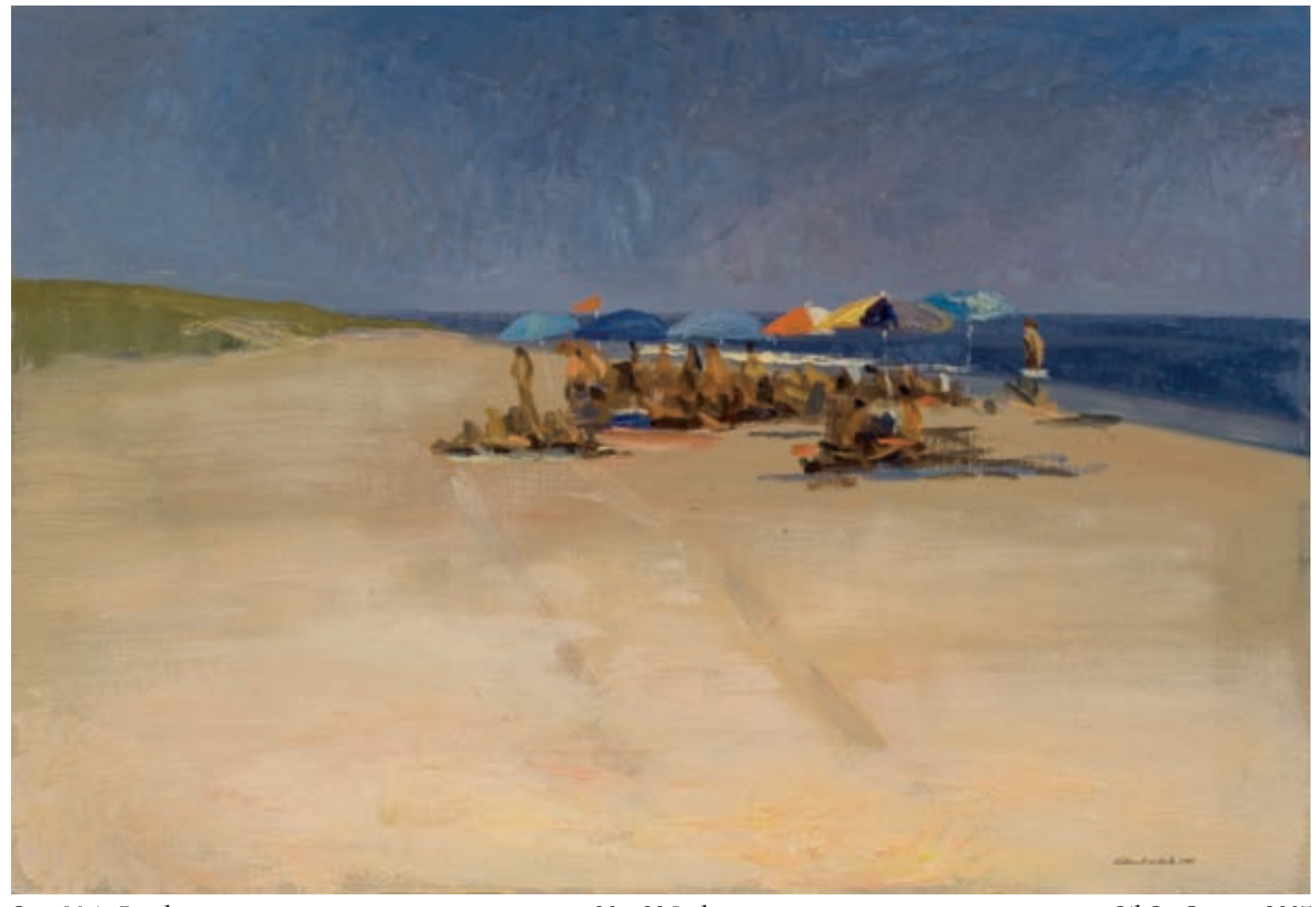
Sagg Main Beach 20 x 29 Inches Oil On Canvas, 2007