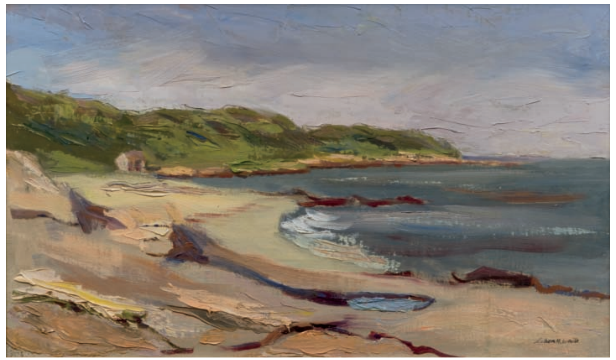
Enders Beach and Rocks 12 x 20 Inches Oil On Canvas, 2009