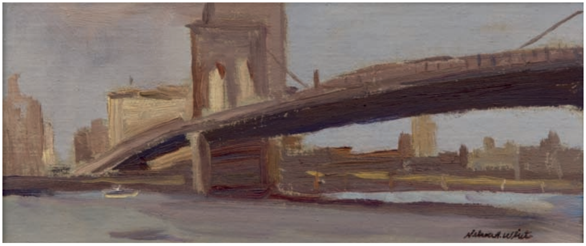
The Brooklyn Bridge 4 x 9 Inches Oil On Canvas, 2007