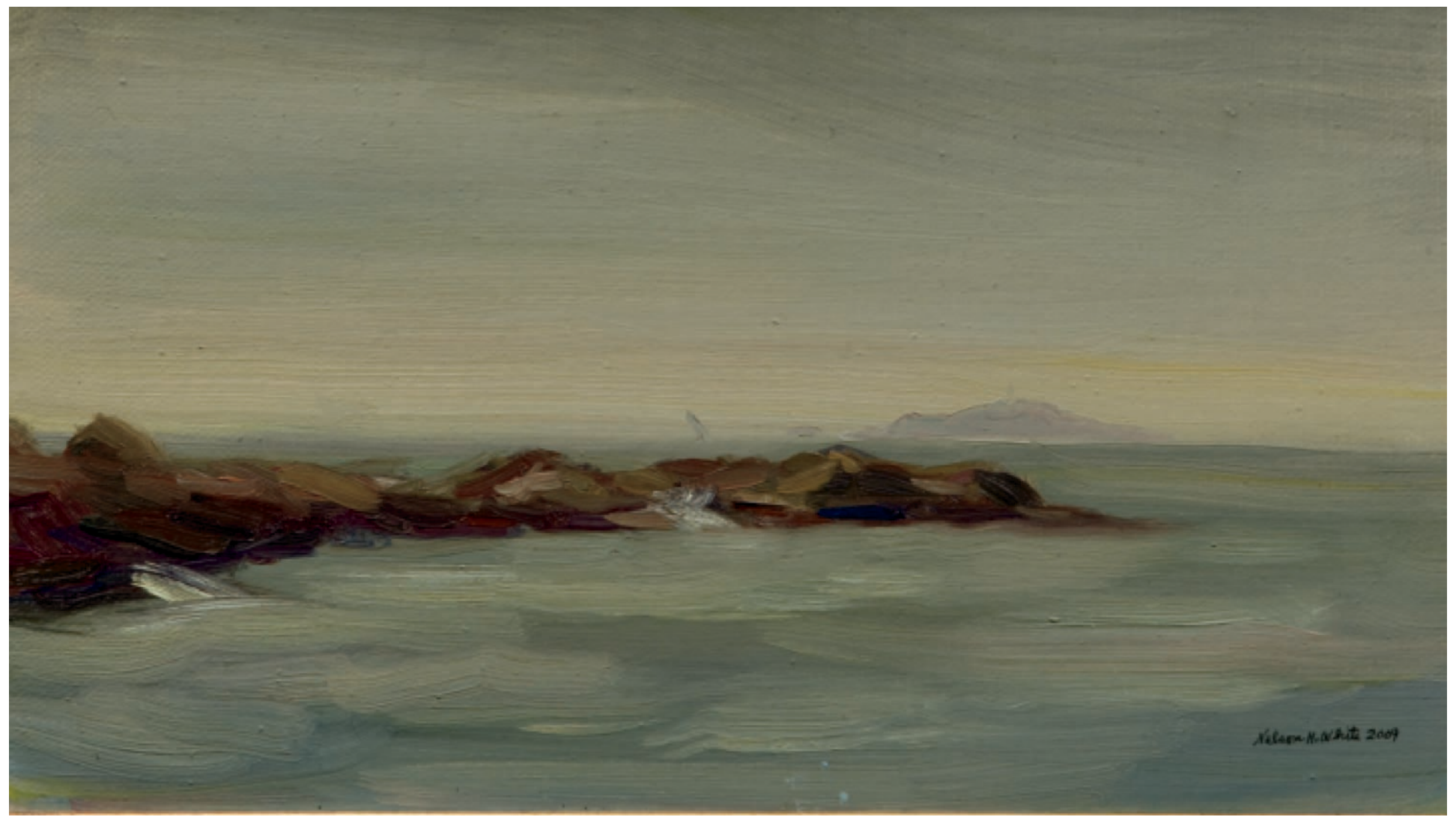
Tellaro, Italy 9 x 16 Inches Oil On Canvas, 2009