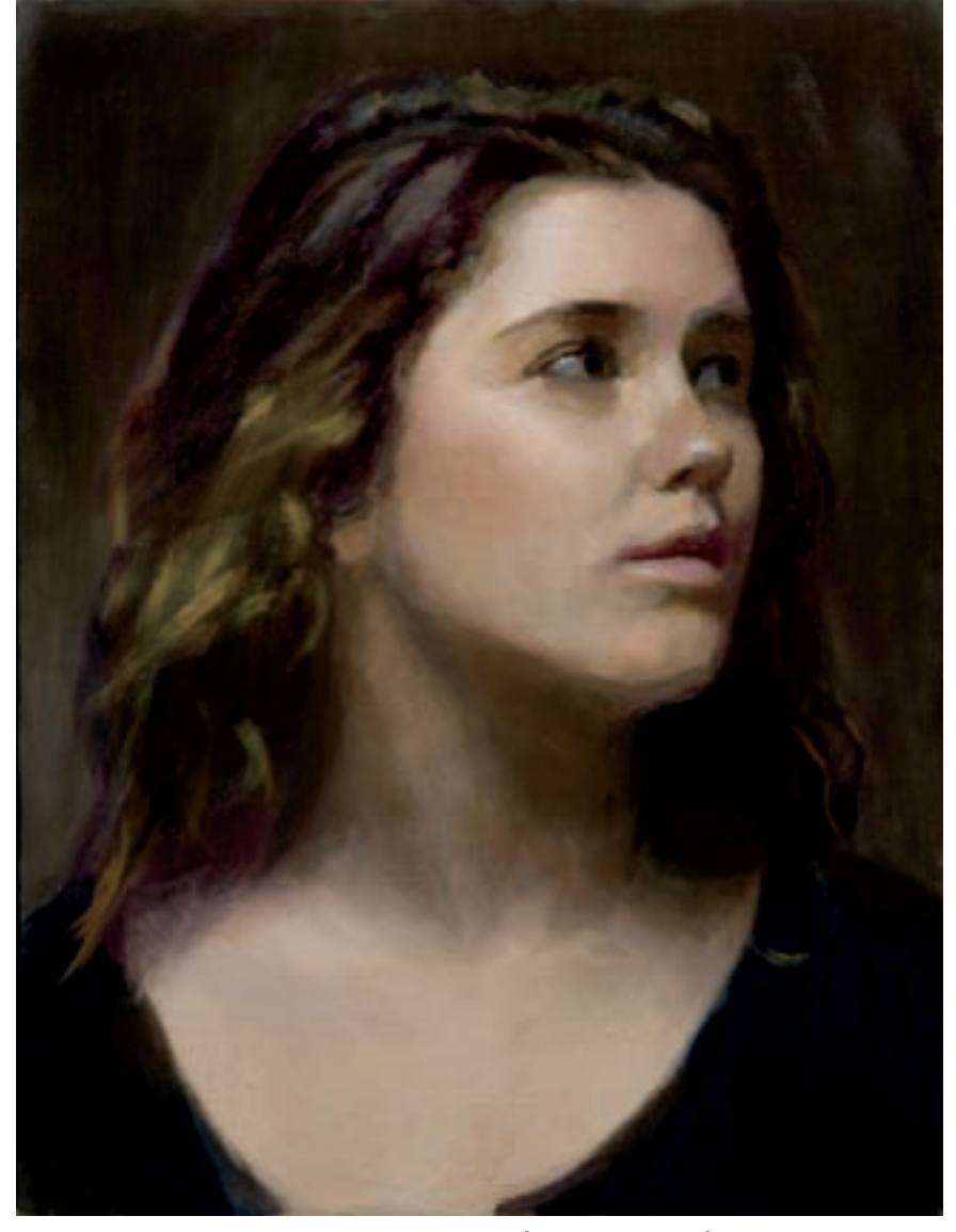
Haven 12 x 16 Inches Oil On Canvas, 2010