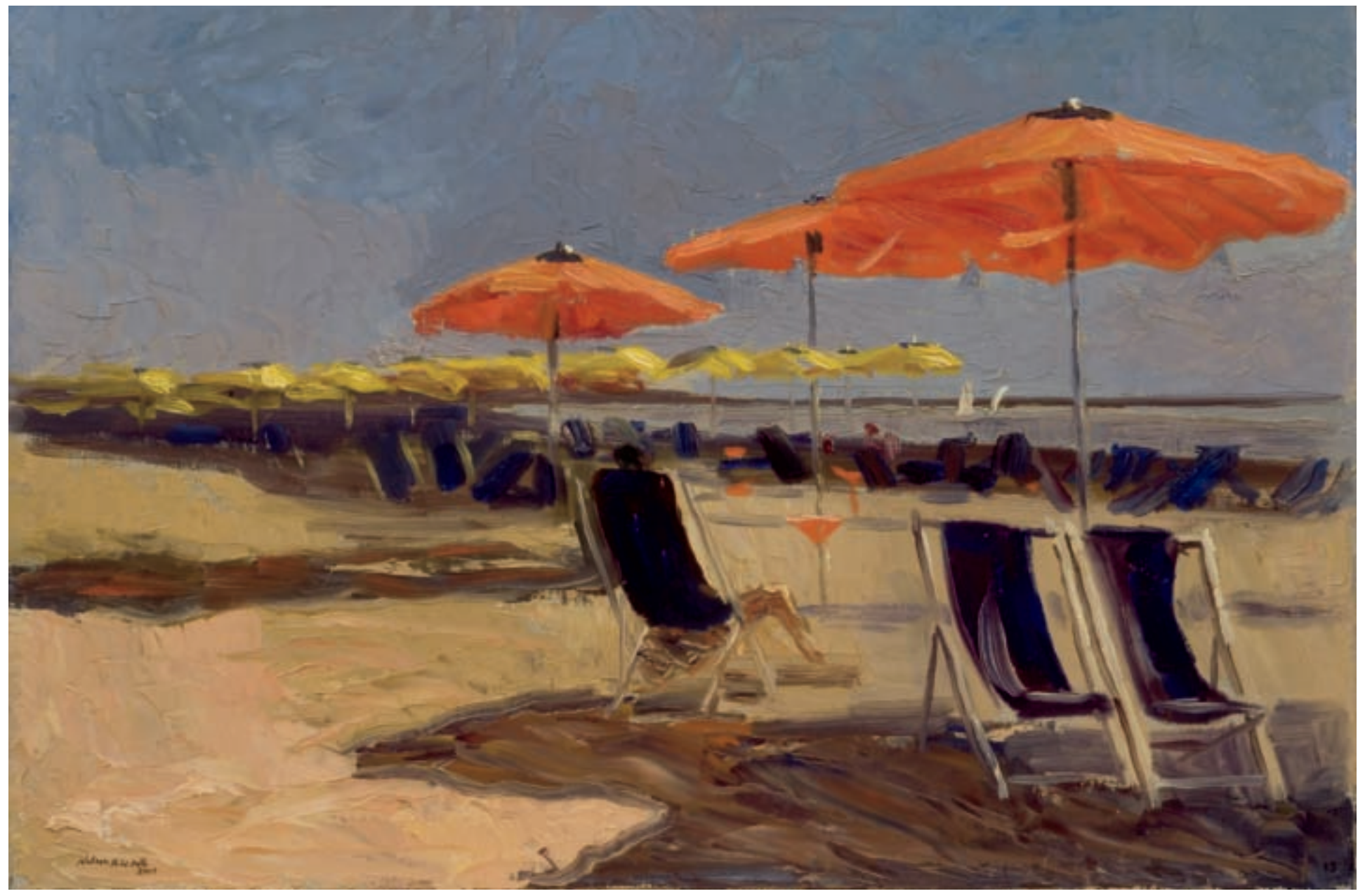
Viareggio, Italy 16 x 24 Inches Oil On Canvas, 2007