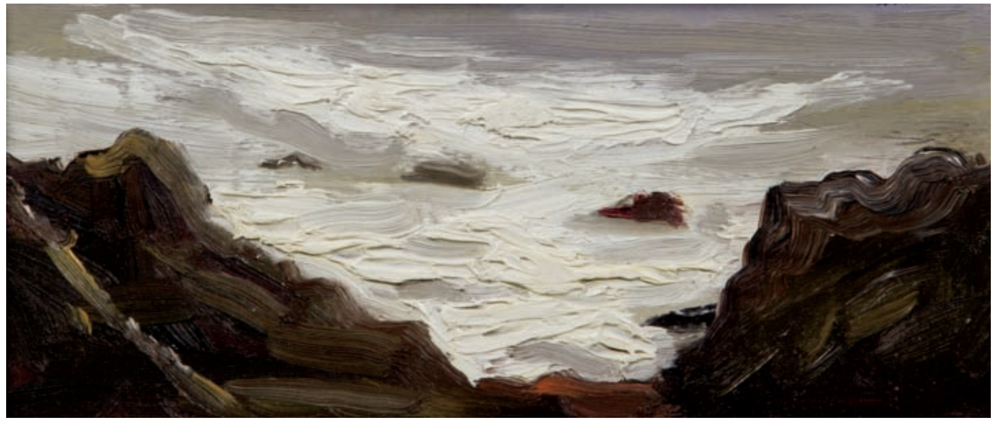
Marginal Way Ogunquit, Maine 4 x 9 Inches Oil On Canvas, 2008