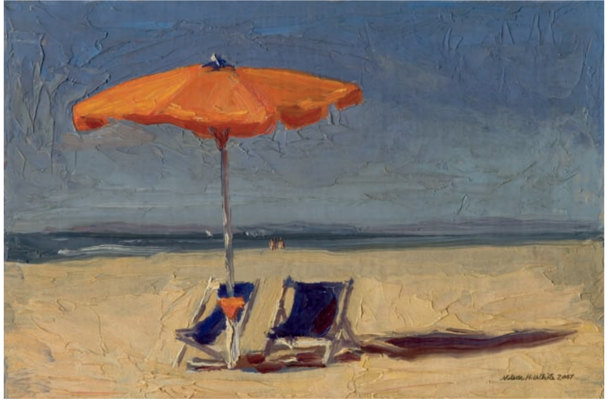
Versilia, Italy 8 x 12 Inches Oil On Canvas, 2007