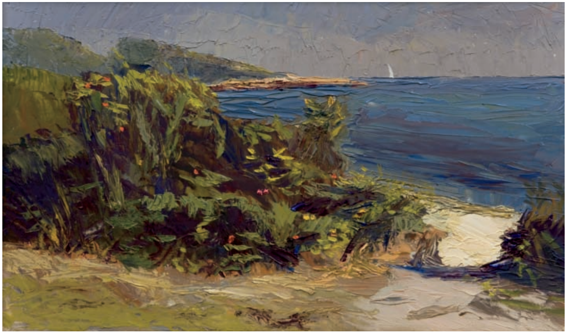
Kitchings Point 12 x 20 Inches Oil On Canvas, 2009