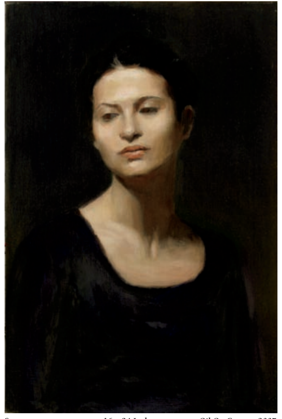
Sara 16 x 24 Inches Oil On Canvas, 2007