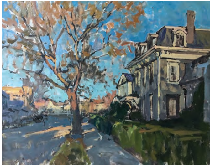
"Evening Light, Main Street" 23.6 x 27.5 inches, Oil on Canvas, 2016