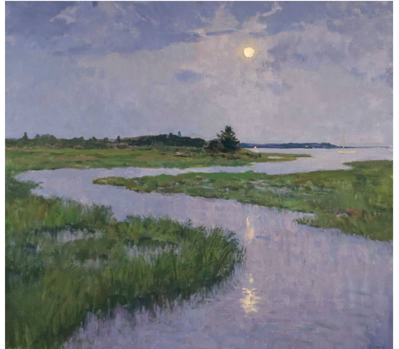
“Full Moon Over Shelter Island” 36 x 40 inches, Oil on Linen, 2020