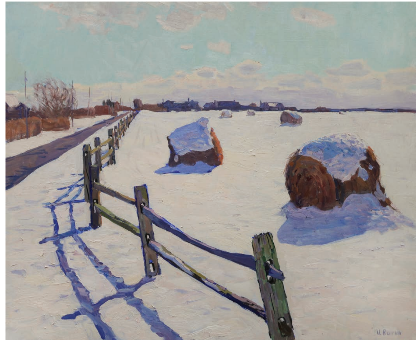
"Hay Bales in the Snow" 30 x 36 inches, Oil on Linen, 2021