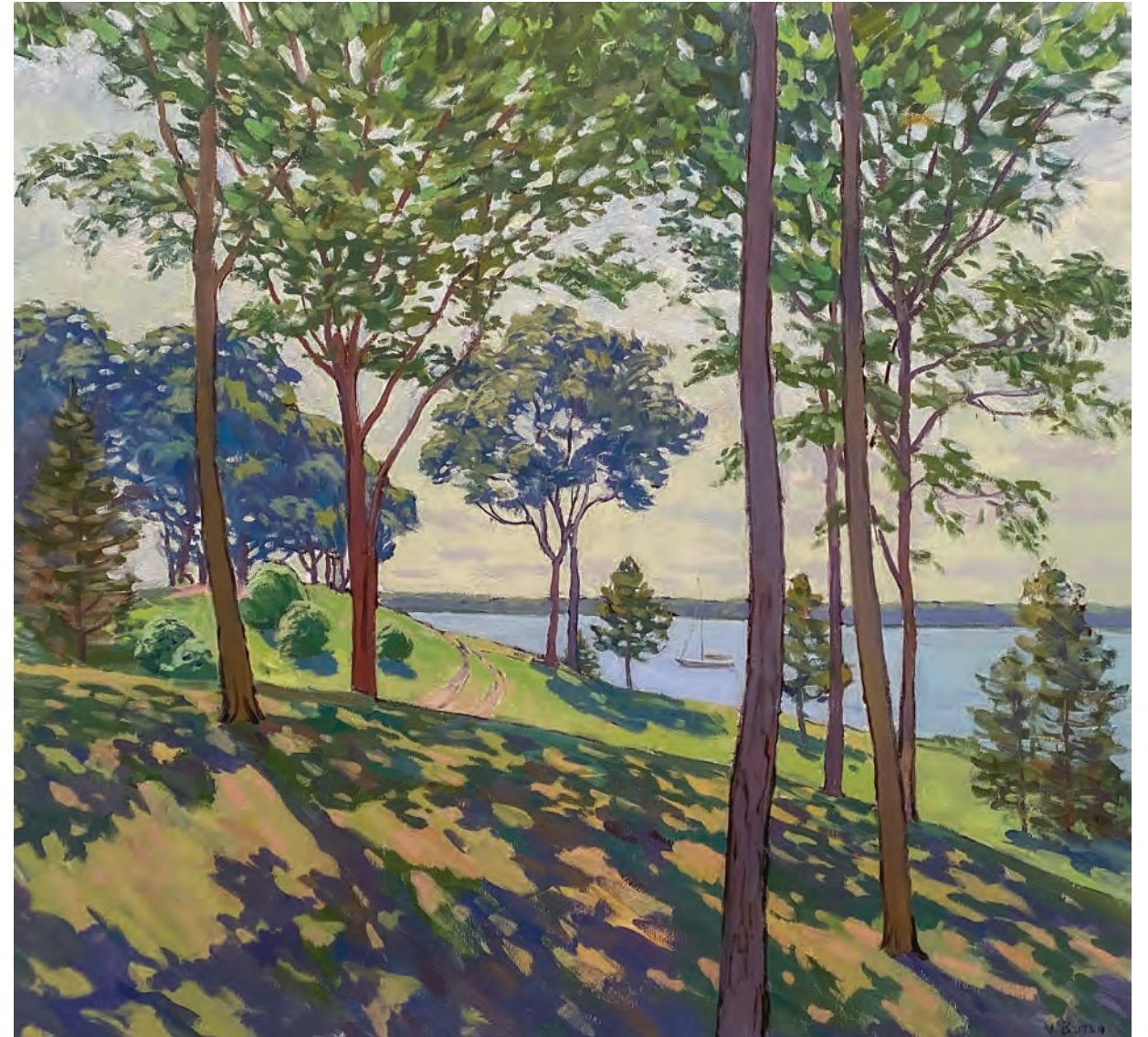
"Dappled Light on the Hill" 36 x 40 inches, Oil on Linen, 2020