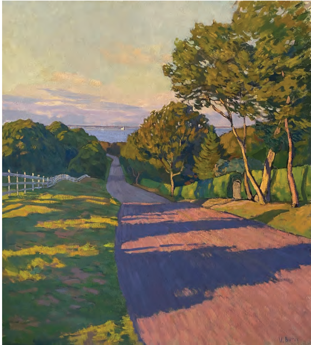
"Bug Light from Ram Island Drive" 36 x 40 inches, Oil on Linen, 2020