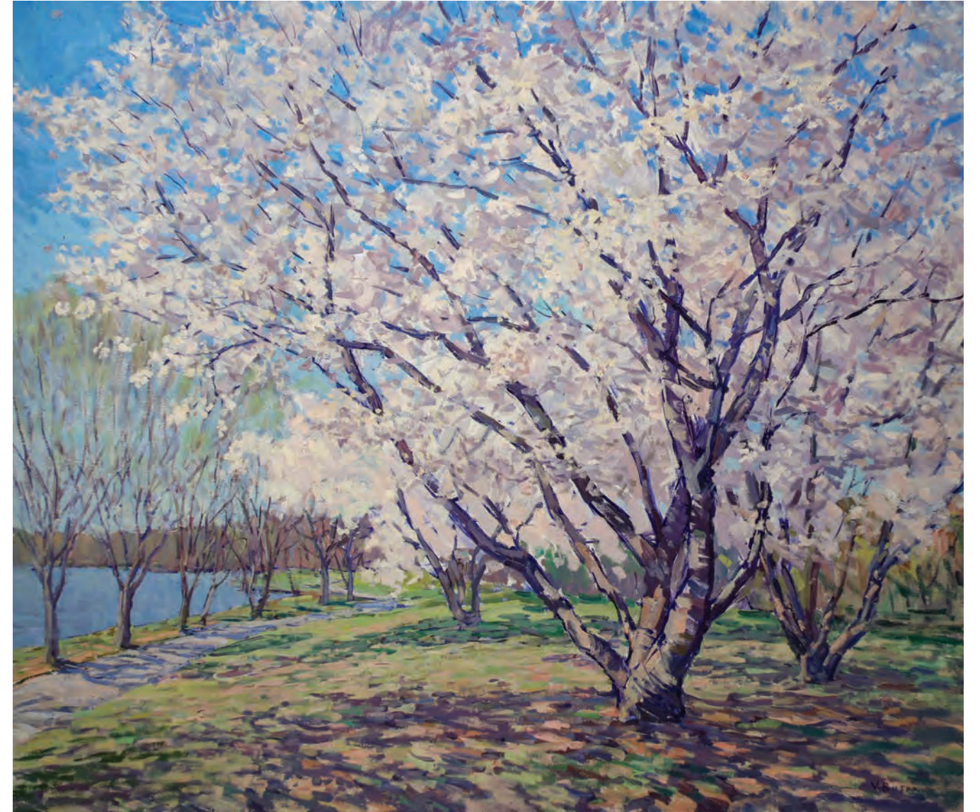
“Along the River” 40 x 47 inches, Oil, 2021