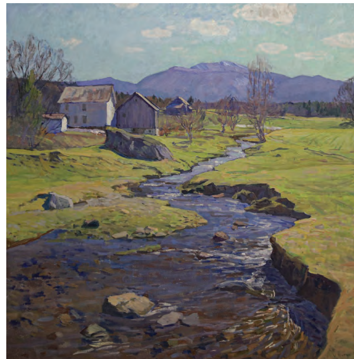
“Blue Creek” 41 x 41 inches, Oil on Linen, 2020