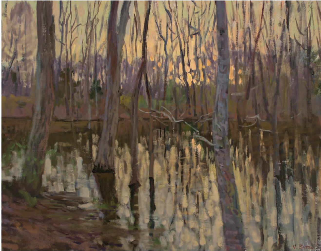
“Deer Park Lane” 22 x 28 inches, Oil on Canvas, 2018