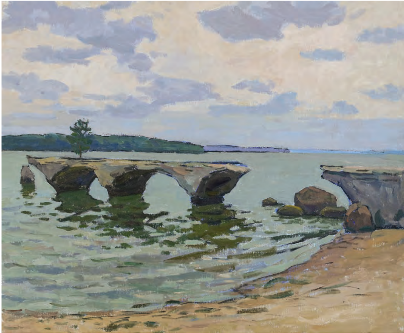
“The Old Pier” 25 x 30 inches, Oil on Linen, 2020