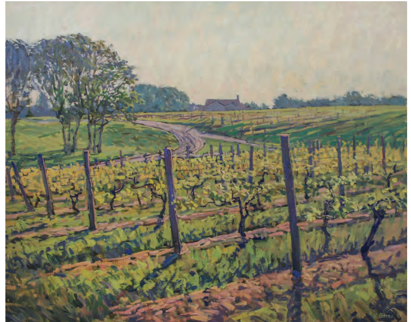
“Wolffer Estate Vineyard” 31.5 x 39.5 inches, Oil on Canvas, 2018