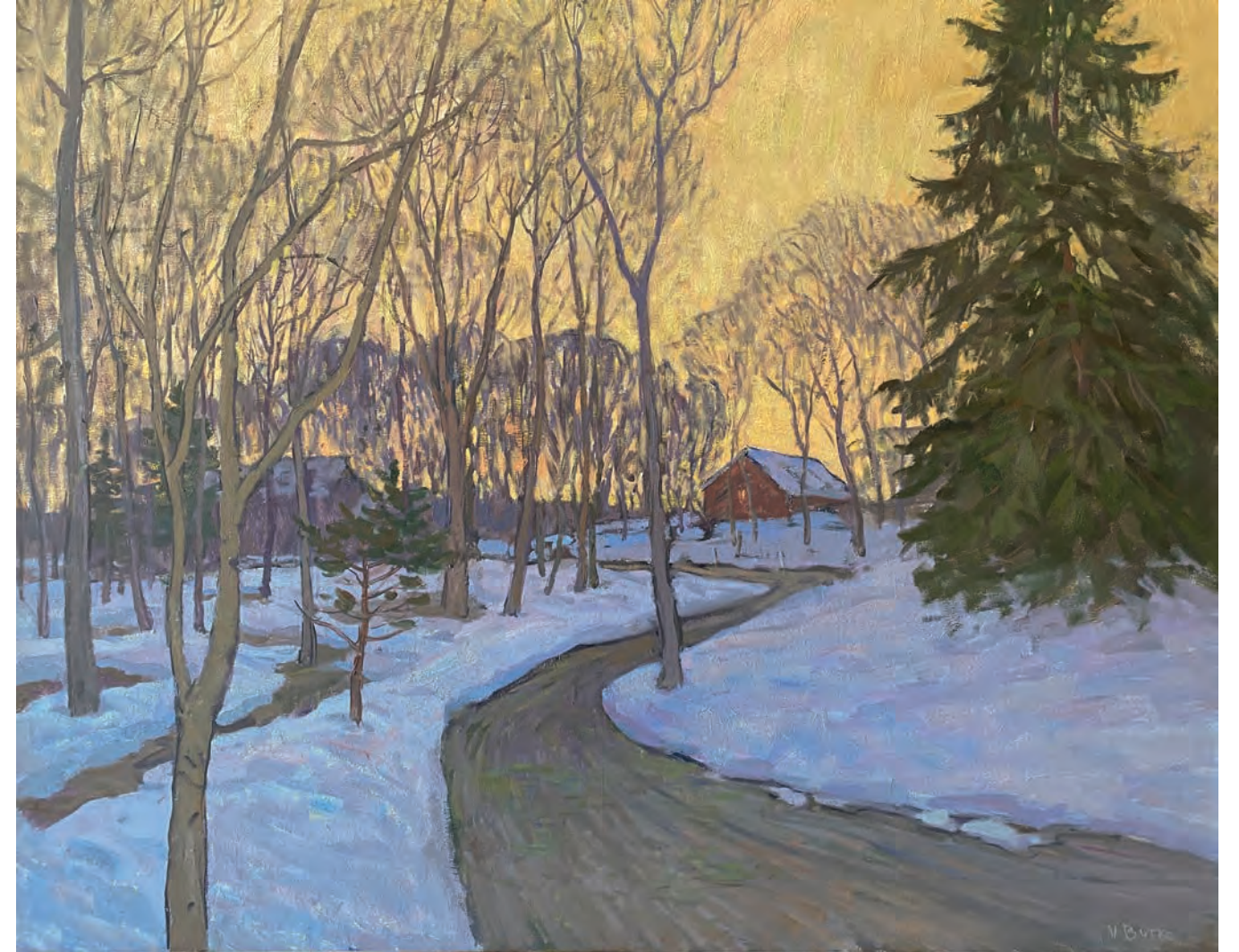
“Golden Evening” 32 x 40 inches, Oil on Linen, 2021