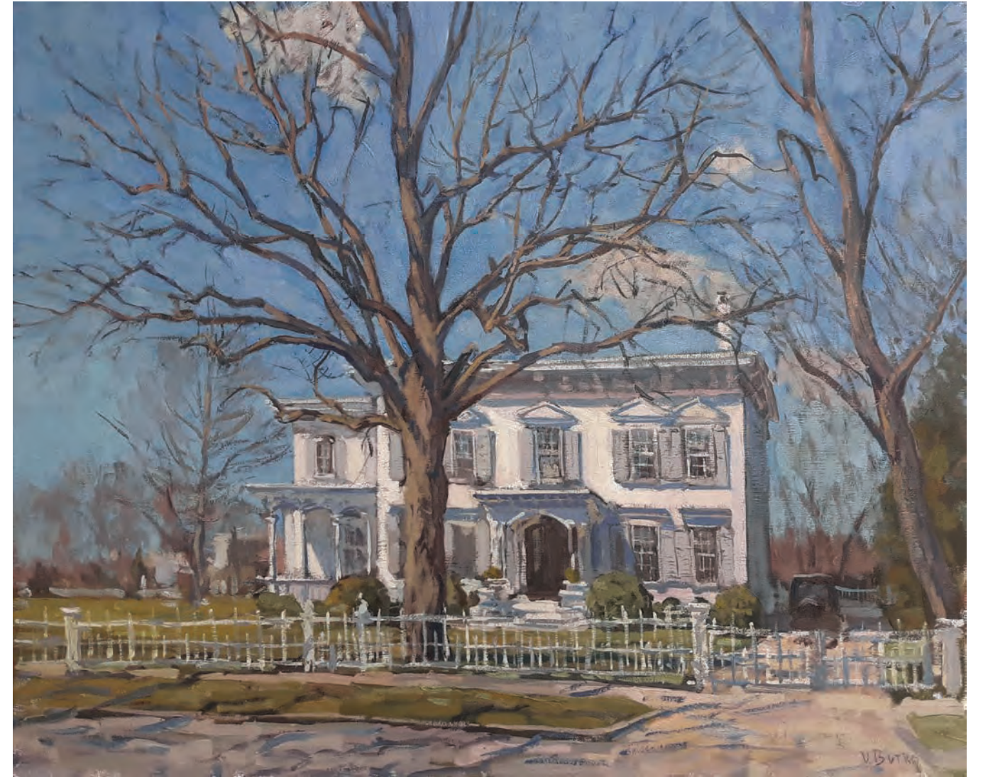
"The Hannibal French House" 25 x 30 inches, Oil, 2018