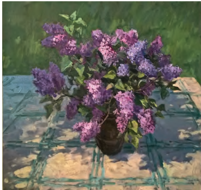
“Sunny Lilacs” 27.5 x 28.8 inches, Oil, 2019