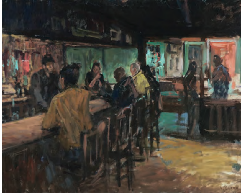
“The Scene at Murfs” 25 x 30 inches, Oil on Linen, 2019