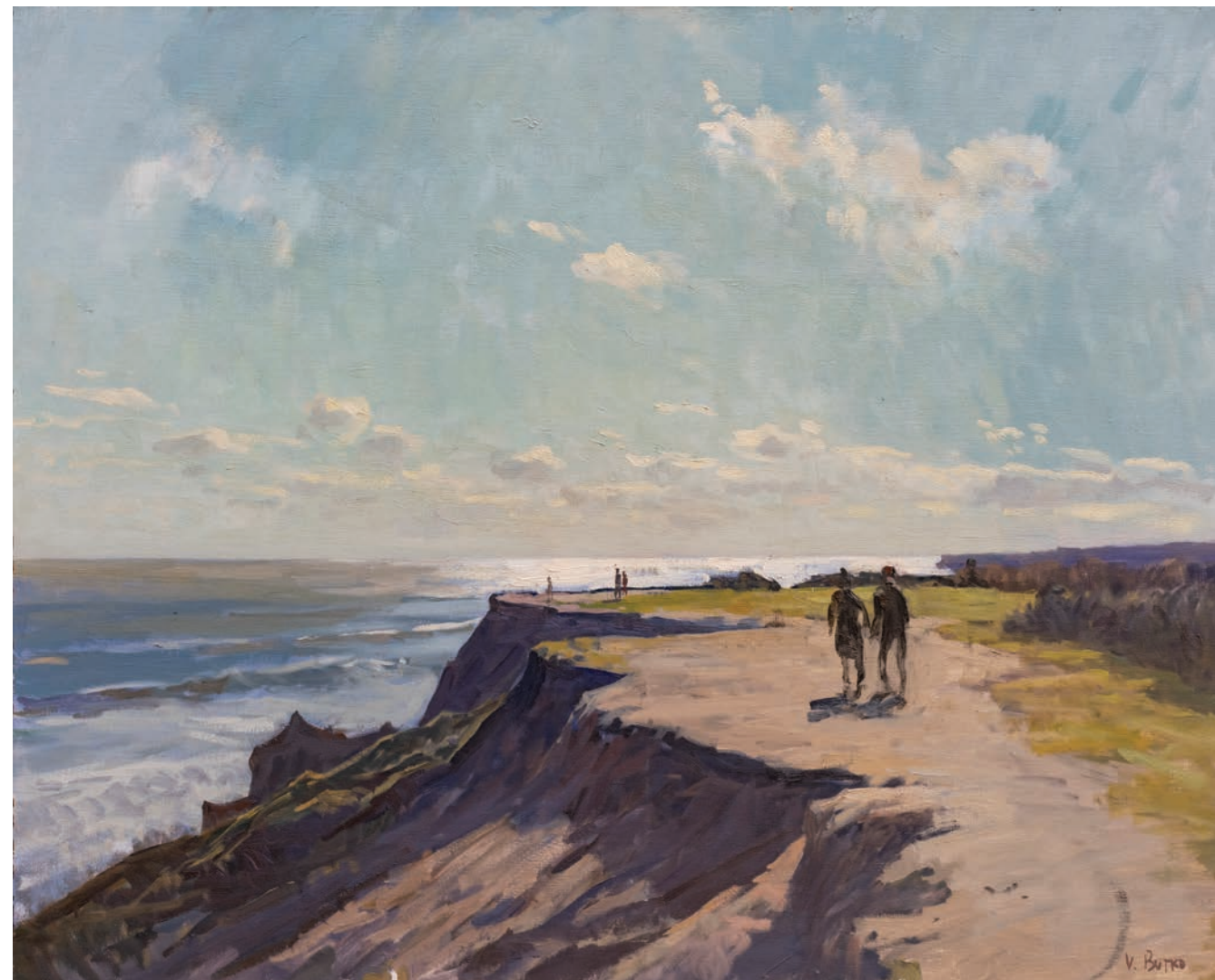
“Montauk Cliffs” 31.5 x 39.3 inches, Oil, 2017