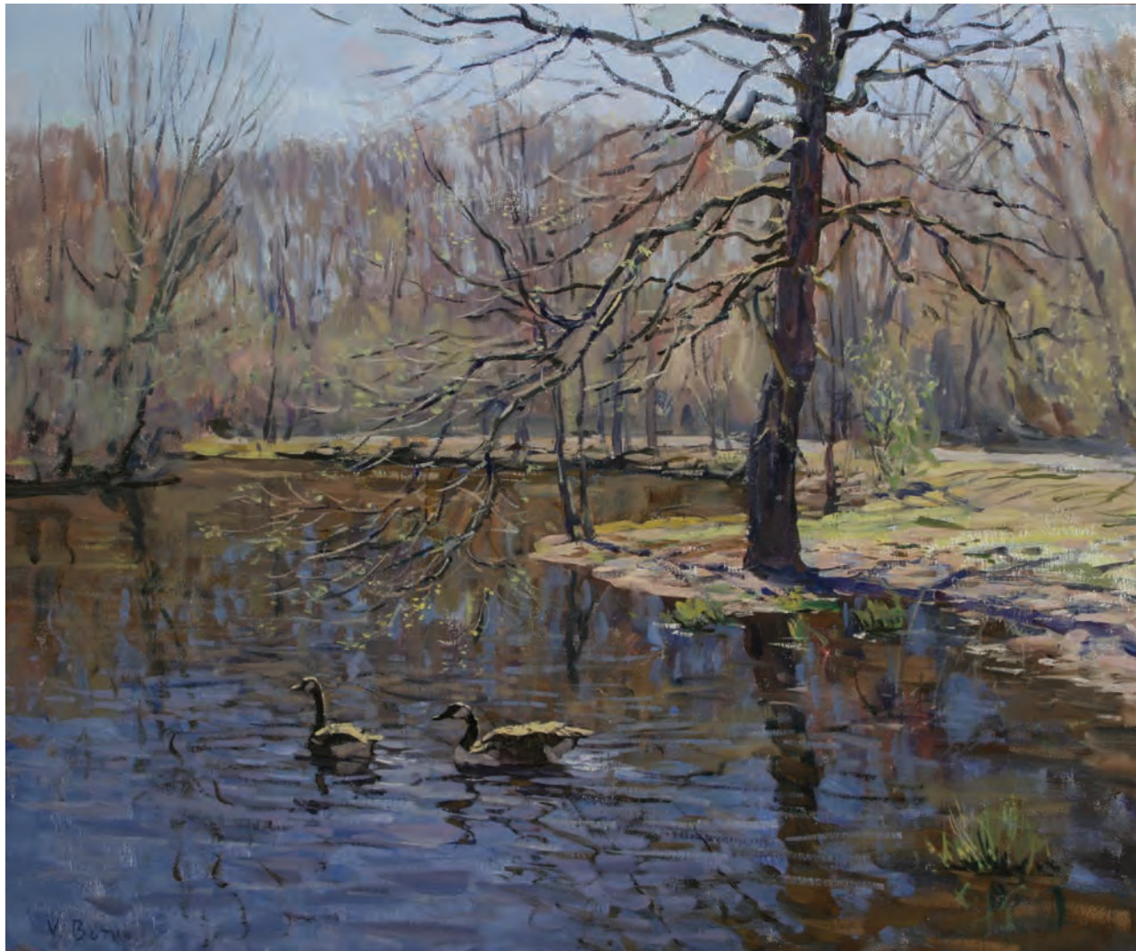
“Shelter Island Pond” 25 x 30 inches, Oil on Canvas, 2019