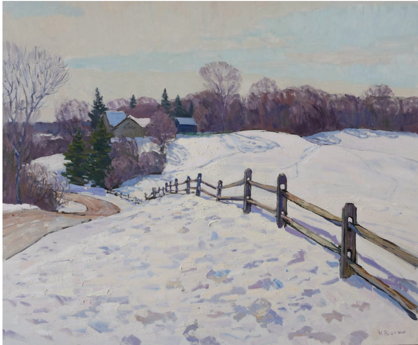
“Snowy Morning, Gardiners Bay Drive” 30 x 36 inches, Oil on Linen, 2021