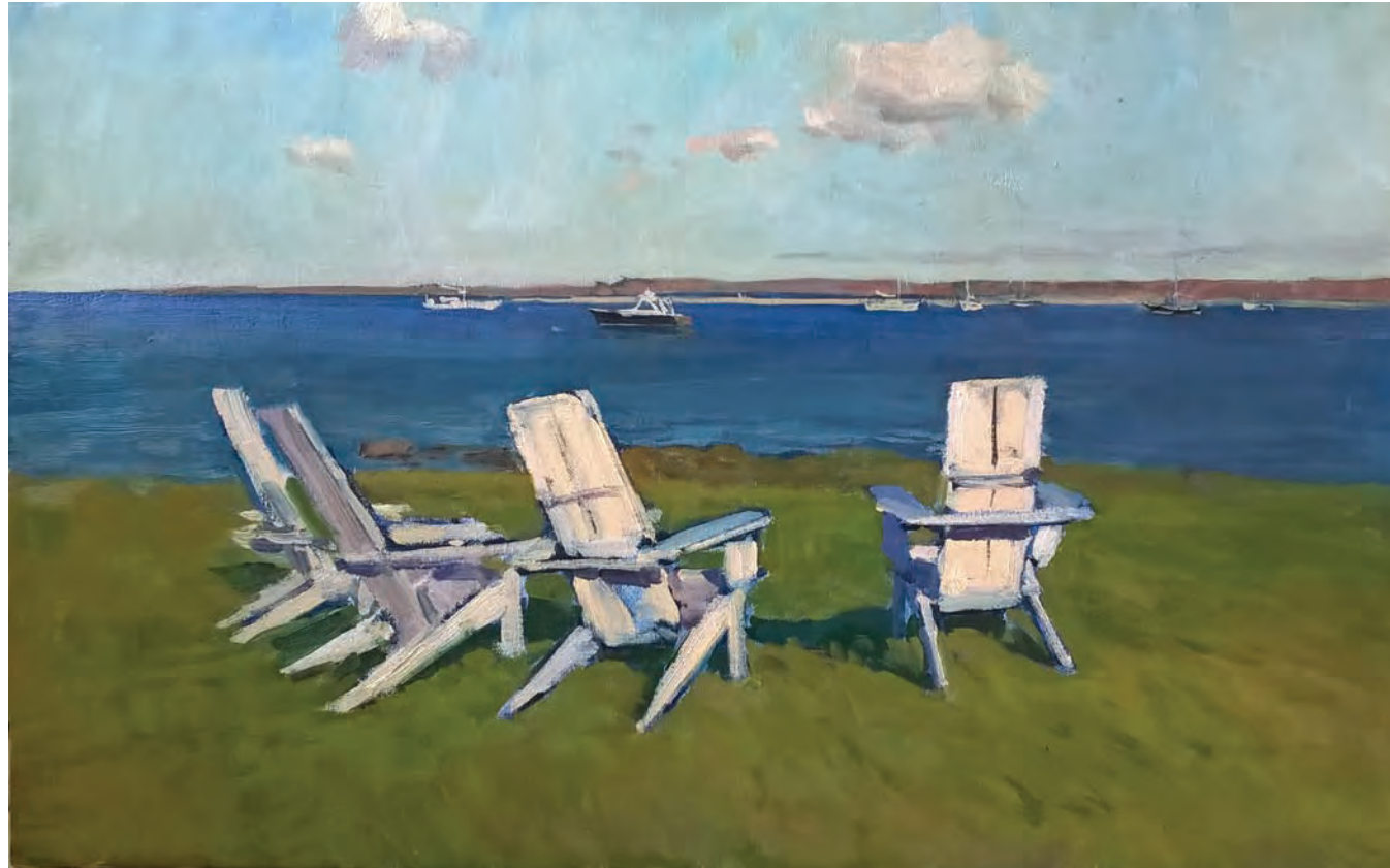
“Chairs” 19.5 x 31.5 inches, Oil on Canvas, 2016