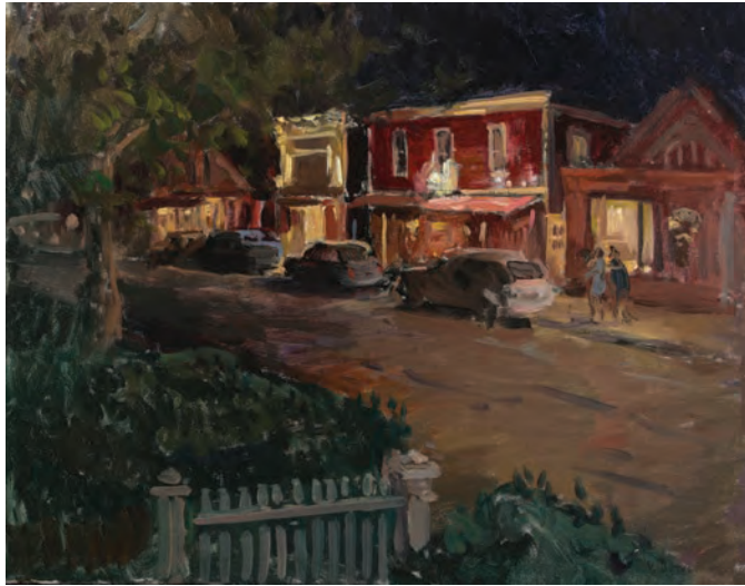
"Evening, Madison Street" 22 x 28 inches, Oil, 2017