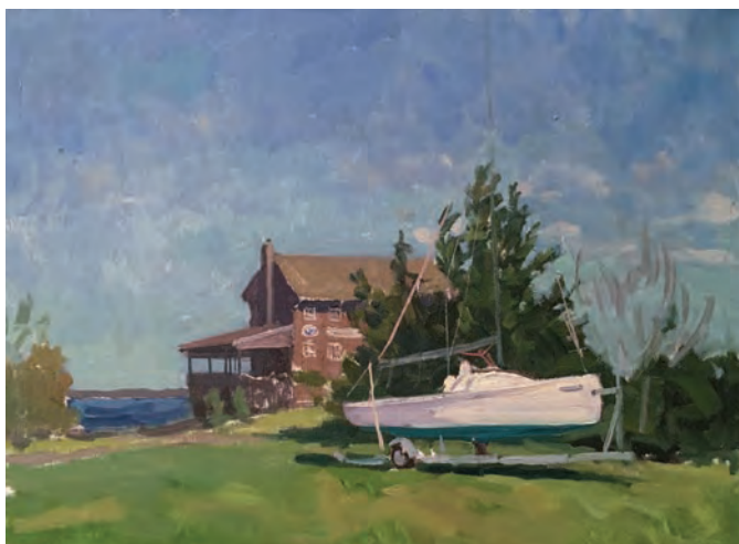
“Breakwater Yacht Club” 18 x 24.25 inches, Oil on Canvas, 2016