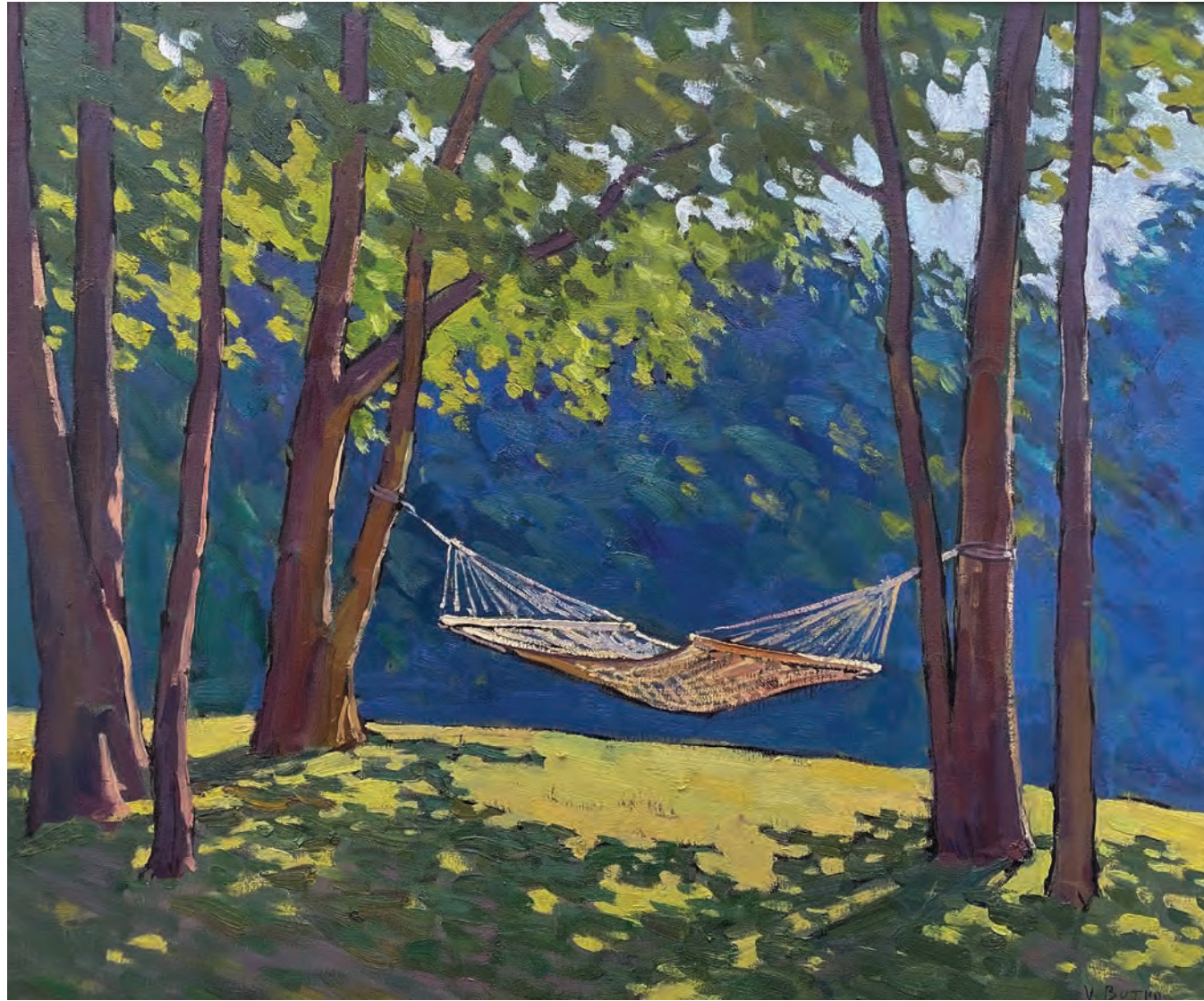
"Life is Good" 20 x 24 inches, Oil on Linen, 2020