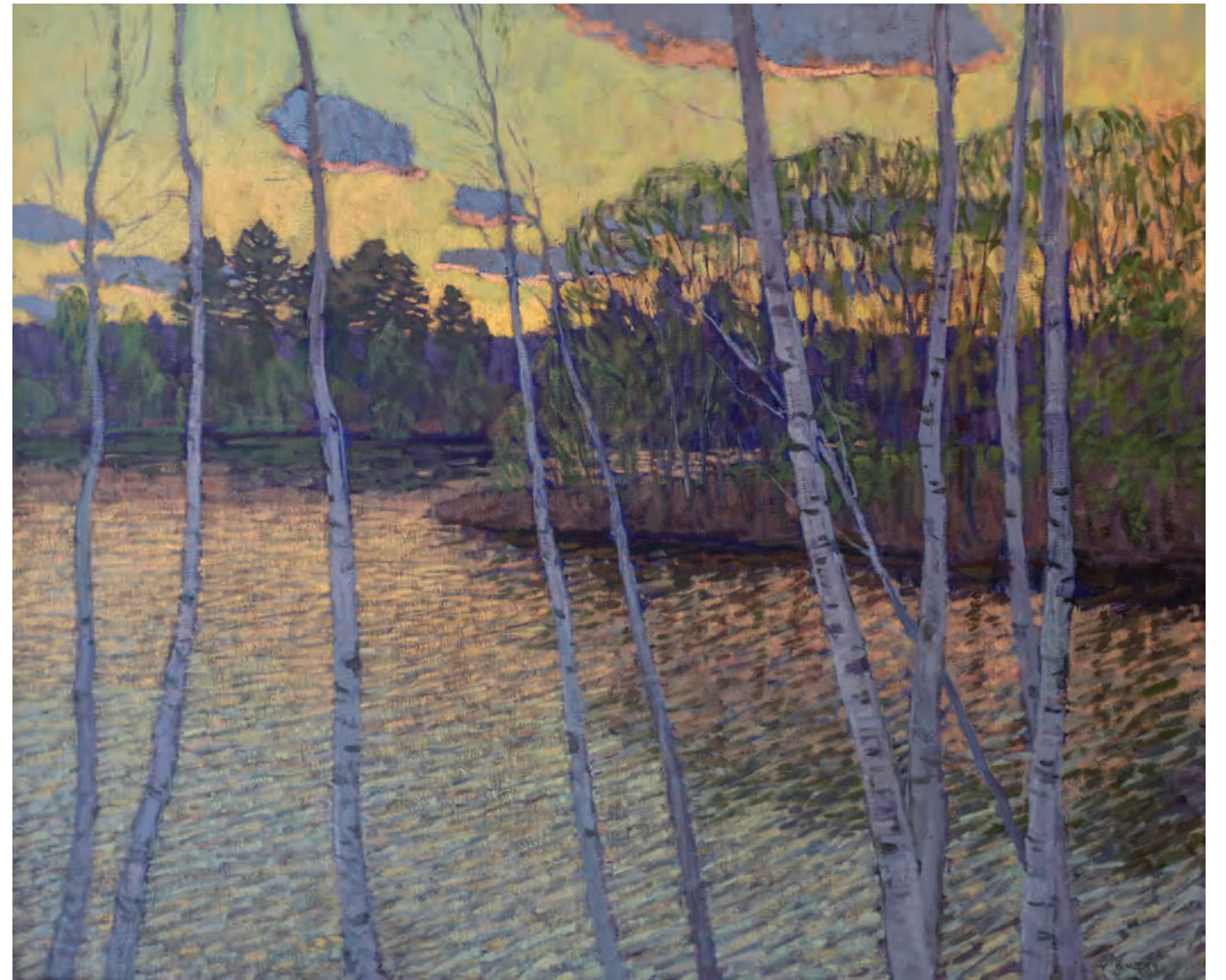
“Over the Pond, Evening Light” 35 x 43 inches, Oil on Linen, 2020