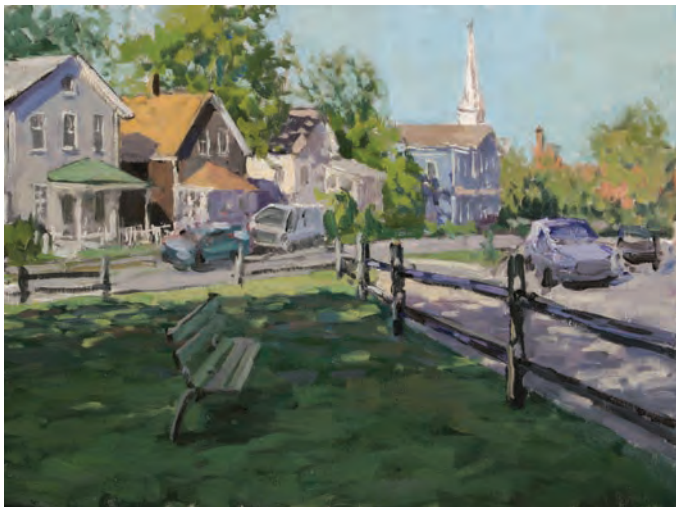
“Village View” 18 x 24 inches, Oil on Canvas, 2016