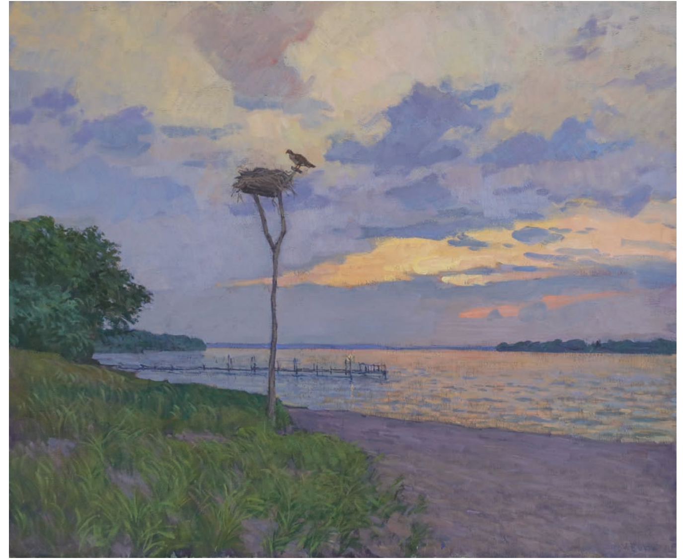
"Osprey's Sunset" 39.5 x 47 inches, Oil on Linen, 2020