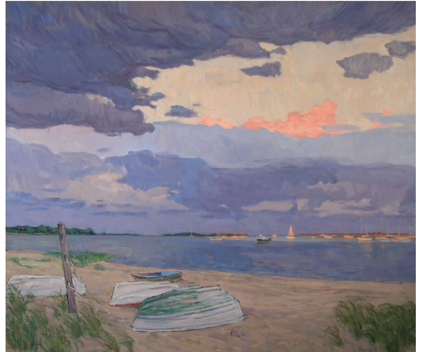
"Stormy Evening Secret Beach" 40 x 47 inches, Oil on linen, 2021