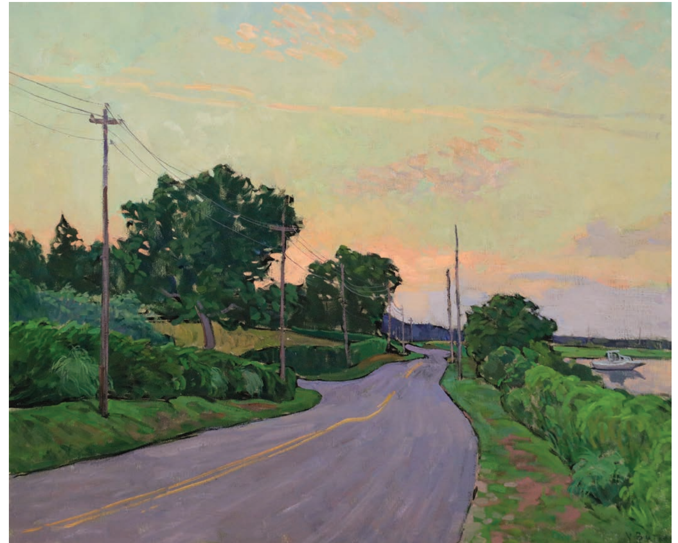
“On the way to Ram Island” 36 x 44 inches, Oil on Linen, 2020