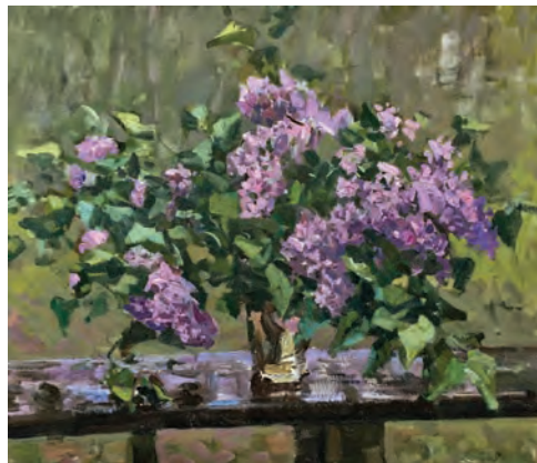
“Lilacs on a Table” 20 x 24 inches, Oil on Canvas, 2018