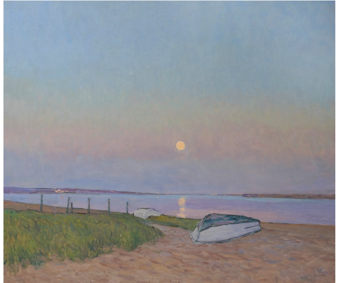
“Pink Moon, Provincetown” 40 x 47 inches, Oil, 2021