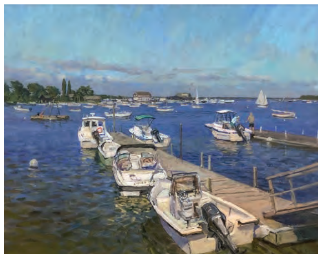
"Docks at Dering Harbor" 32.5 x 40.25 inches, Oil on Canvas, 2019