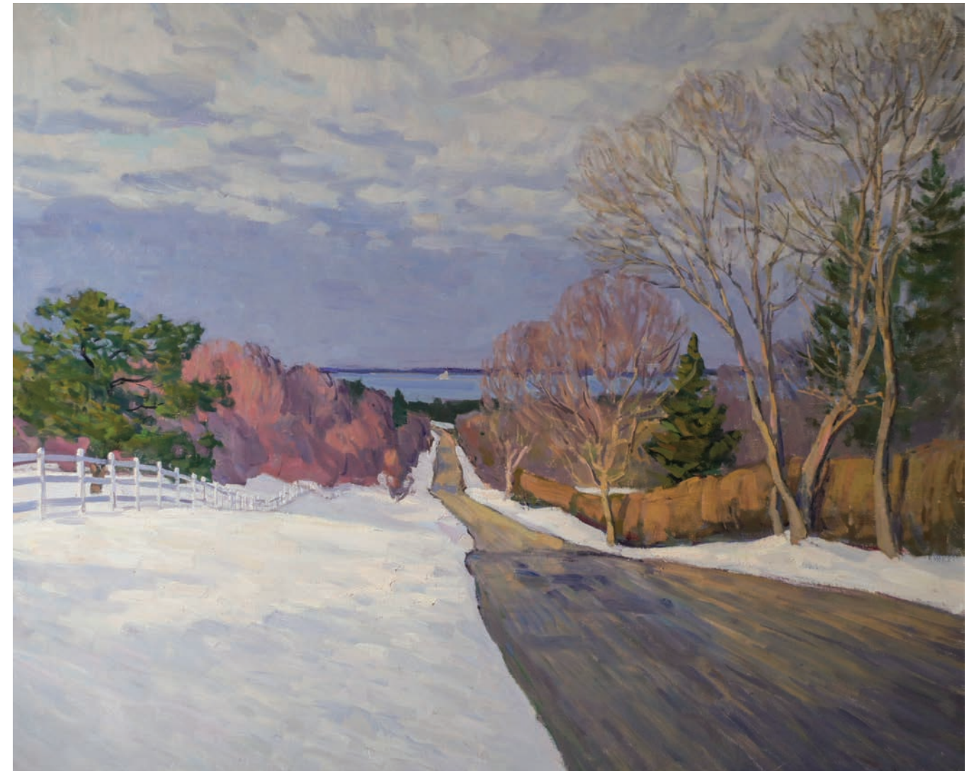
"Ram Island Road in Winter" 36 x 44 inches, Oil on Linen, 2021