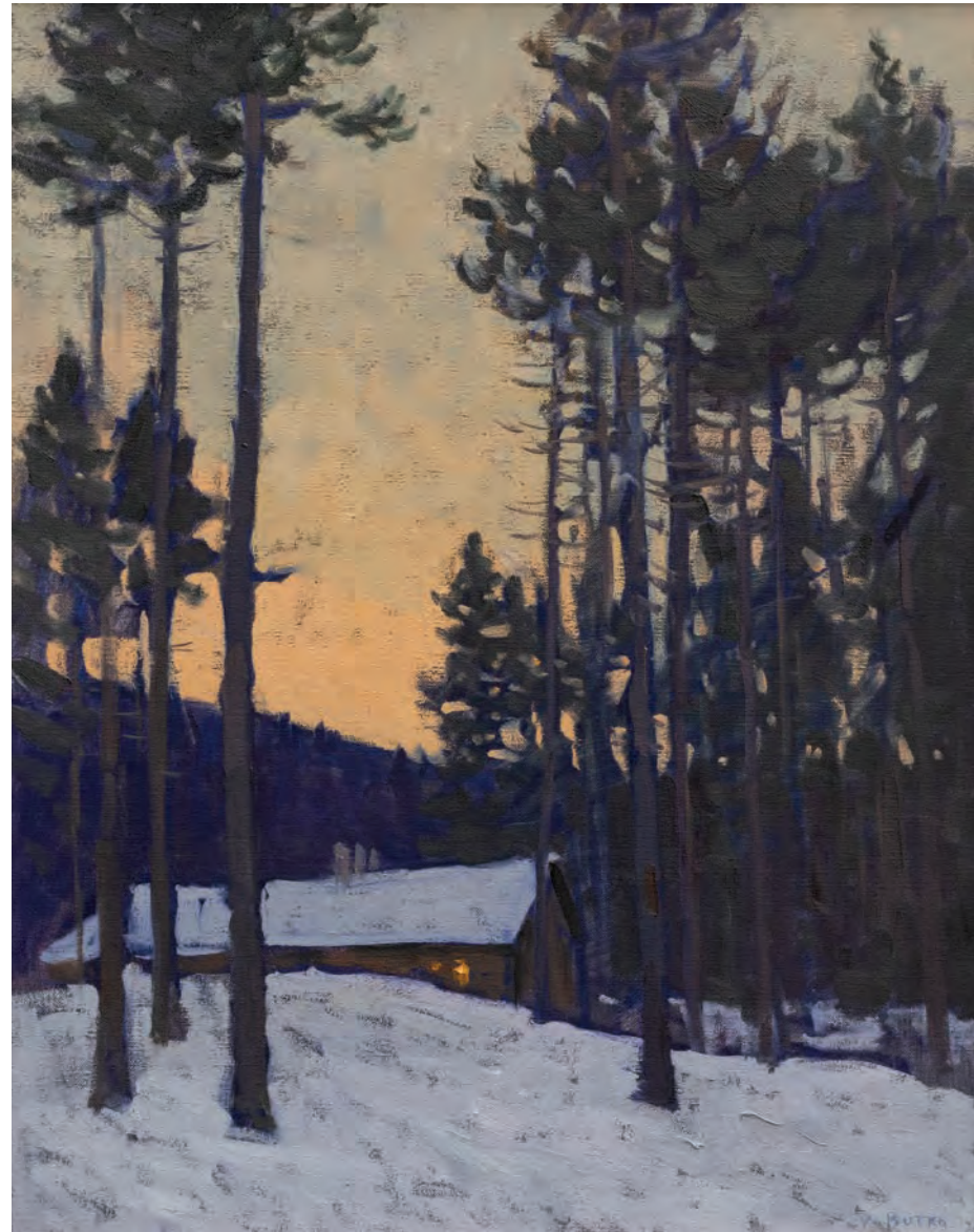
"In the Woods" 28 x 22 inches, Oil on Linen, 2020