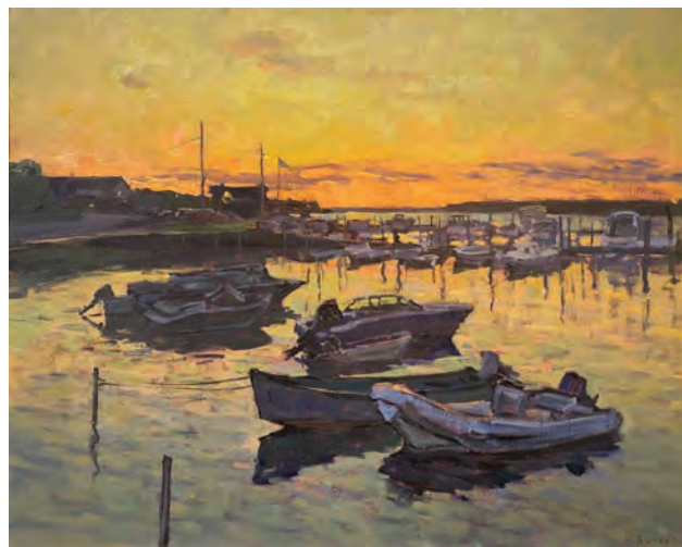
"Sag Harbor Village Marina at Sunset" 32 x 40 inches, Oil on Linen, 2020