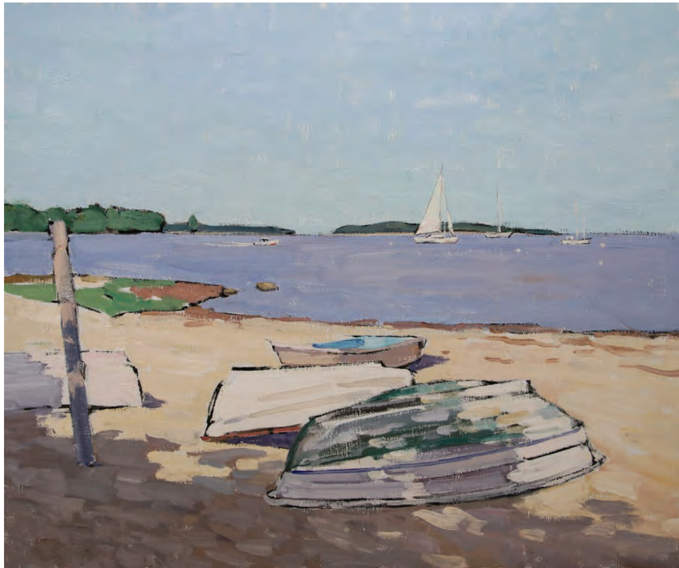
"Boats at Secret Beach" 25 x 30 inches, Oil on Linen, 2020