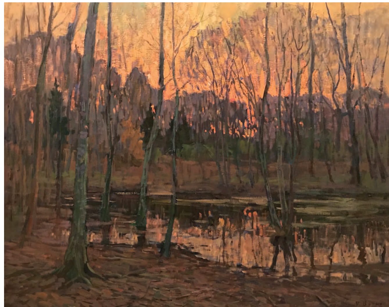
"Light of the Setting Sun" 32 x 40 inches, Oil on Linen, 2019