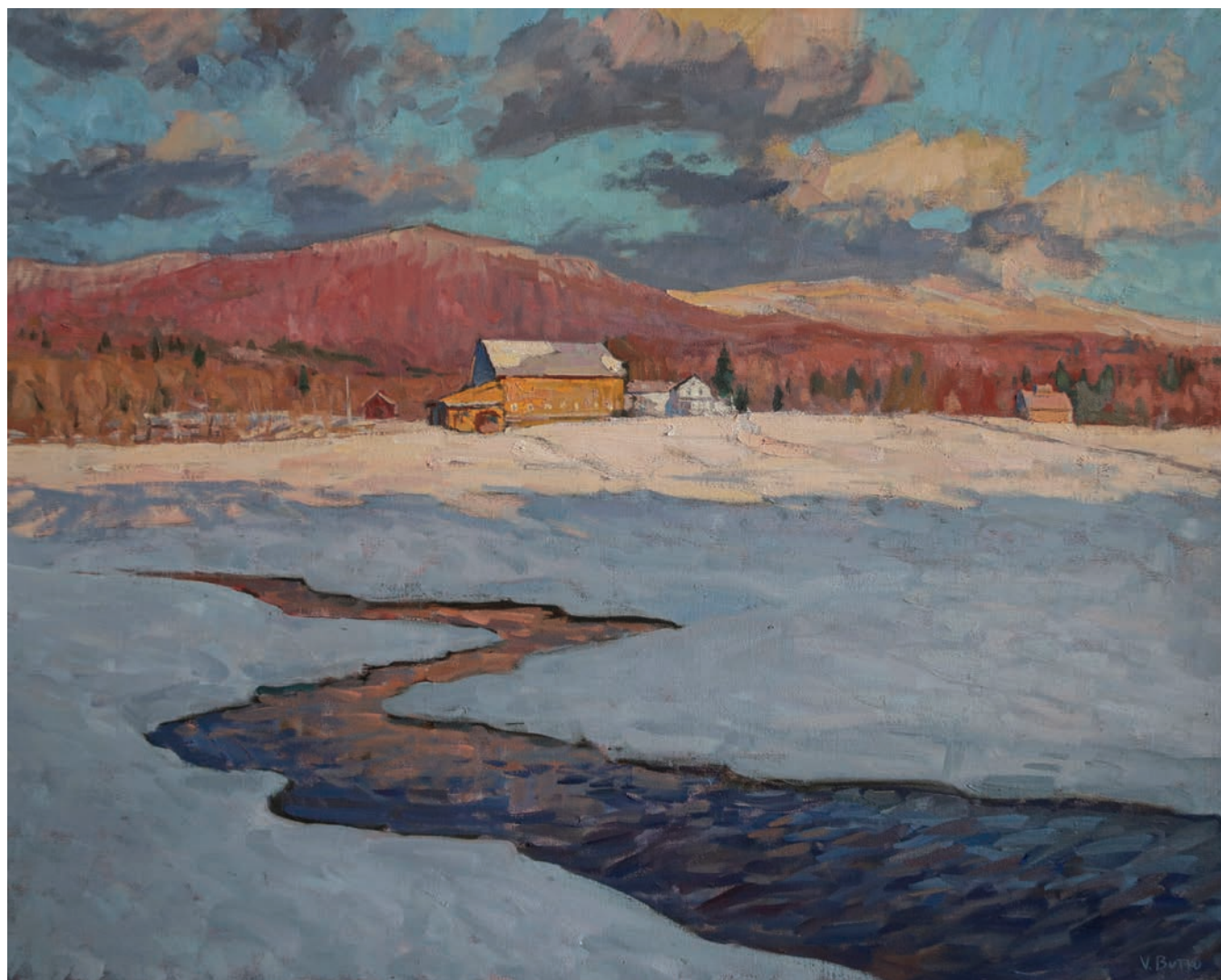
“Spring is Getting Closer” 32 x 40 inches, Oil on Linen, 2020