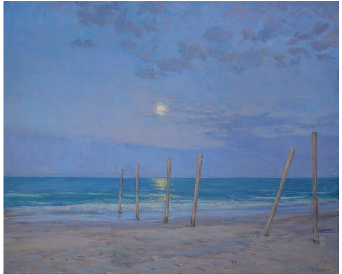
“Cloudy Moonrise” 36 x 44 inches, Oil, 2021