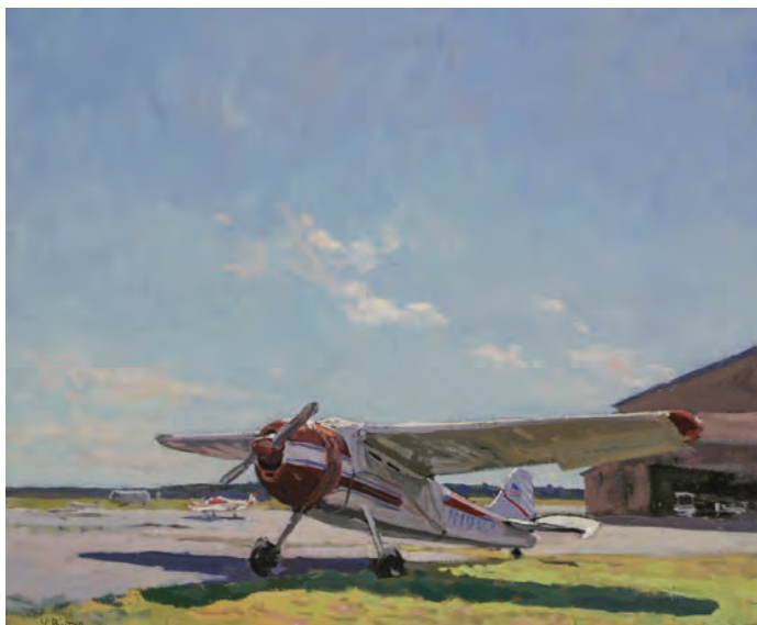
“Clear Blue Skies” 20 x 24 inches, Oil on Canvas, 2018