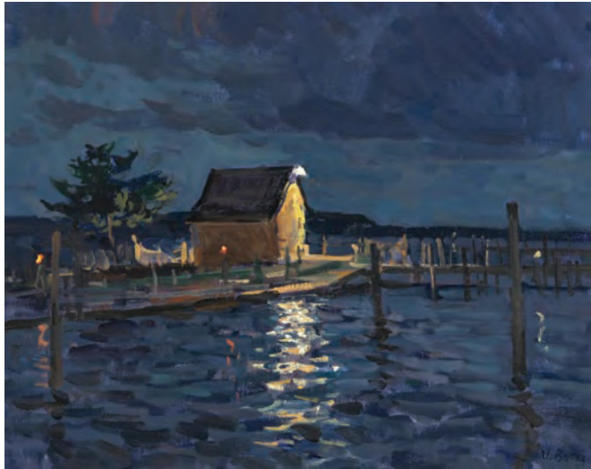
“Waterfront Marina, Dock House” 16 x 20 inches, Oil, 2017