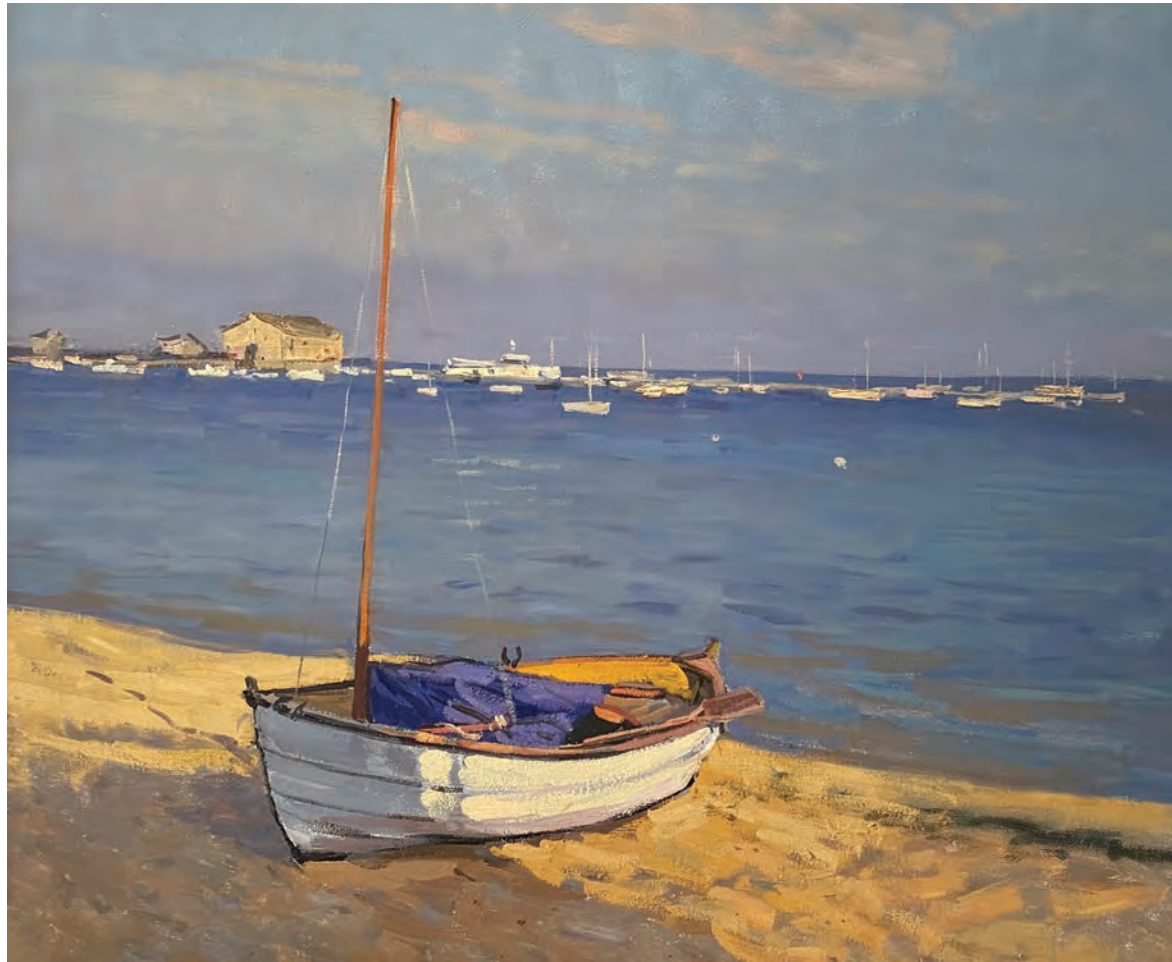
"Sailboat at Rest" 25 x 30 inches, Oil on Linen, 2020